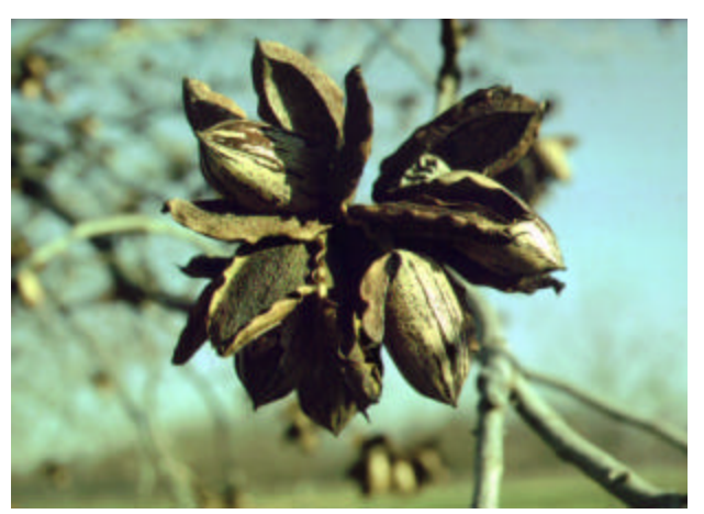
In the fall of the year, the husk enclosing the pecan will split open and allow the nut to fall freely to the ground.

splits open in October to reveal a light brown nut that is streaked with black mottles. As husks dry and wither, nuts fall freely from the tree. Pecan nuts vary widely in size, shape, and shell thickness. Seedling pecan trees often produce small, thick-shelled nuts while trees grafted to improved cultivars produce large, thin-shelled nuts.