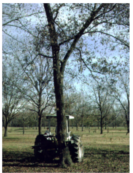
A three-point hitch pecan shaker facilitates the prompt harvest of the pecan crop.

Over 70% of the pecan kernel is composed of unsaturated fats which can become rancid in room temperature storage. To maintain highest nut quality, shell out all your pecans and store the kernels in the freezer. Kept frozen, pecan kernels remain fresh for 2 years or more.