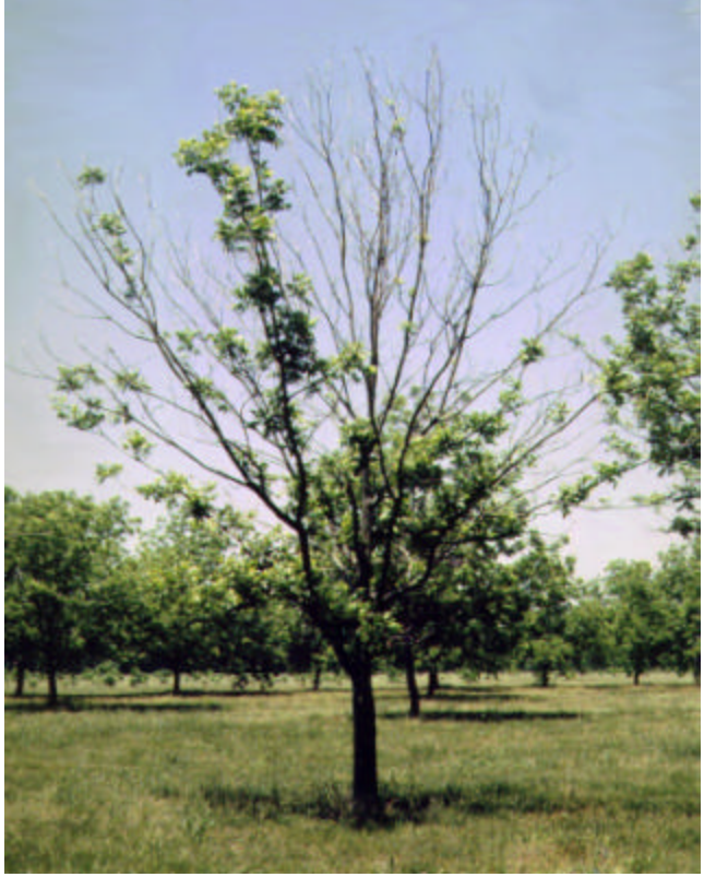
Southern pecan cultivars often suffer severe cold injury when grown in Missouri.

Winter Hardiness. Pecan trees growing in Missouri are often exposed to severe winter temperatures. "Northern" pecan cultivars have proven cold hardiness and are best adapted for growth in Missouri. These cultivars are termed "Northern" because they originated in the northern most reaches of the pecan tree's natural range. Only a few "Southern" pecan cultivars are adapted for growth in the 'bootheel' of Missouri.