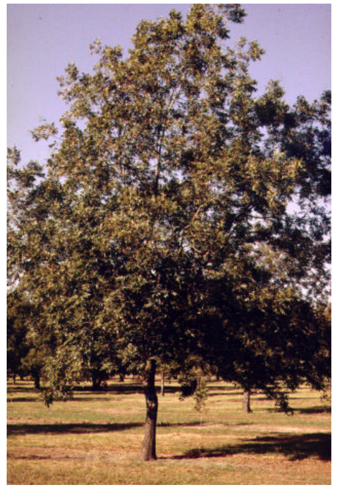
Pecan is an attractive tree both in the orchard and in the home landscape.

Pecan is a large, beautiful tree that produces bountiful crops of delicious nuts. The largest member of the hickory family, pecan trees often grow to a height of over 70 feet with a spread of greater than 80 feet. Pecans have large, pinnately compound leaves with each leaf bearing 7 to 13 leaflets. Nuts are borne on branch terminals in clusters of two to five. A fleshy green husk surrounds the nut during the growing season but