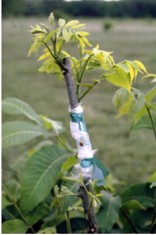
The three-flap graft is a popular method used for propagating pecans.

Grafted Trees. Transplanting grafted trees of desired cultivars is the simplest way to establish a pecan orchard. Trees should start to bear nuts within 5 to 7 years after transplanting. Unfortunately, many of the cultivars recommended for Missouri are not widely available from commercial nurseries making it difficult to obtain grafted trees.