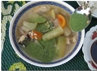
Fig. 5 Moringa leaf powder added to food.

Would they be receptive to adding new foods, such as moringa pods, to their diets? "This has been surprisingly successful, since new foods are often very difficult to introduce in West Africa. People interviewed have shown considerable inventiveness when it comes to preparing moringa pods, seeds and flowers."