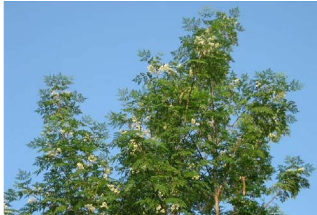
Moringa oleifera tree.

Published 1985; Revised 2000, 2002, 2007 by ECHO Staff