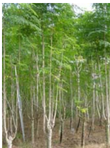
Fig. 6-7. Moringa trees growing at ECHO (Fig. 6; left) and as a household tree in Africa (Fig. 7; right)