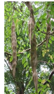
Figs 17-18. Flowers (left; Fig. 17) and pods (right; Fig. 18) of Moringa stenopetala in Haiti.