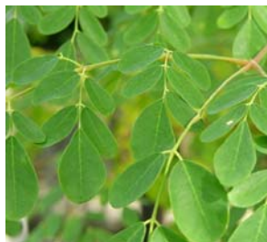
Fig. 1 Moringa leaves.

Leaflets (Fig. 1) can be stripped from the feathery, fern-like leaves and used in any spinach recipe. They are exceptionally nutritious. Very young plants can also be used as a tender vegetable. In many cultures, the diet consists mainly of a starchy dish or porridge made from corn meal, cassava, millet or the like. Side dishes or "sauces" served with the starchy main dish are therefore very important nutritionally, as they are often the only source of extra protein, vitamins and minerals. Moringa leaves could easily be added to such sauces as a potherb or as dried herbs. ECHO has published a separate Technical Note that includes numerous moringa recipes.