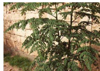
Table 2. Nutritional value of Moringa oleifera .* Moringa pods, fresh (raw) leaves and dried leaf powder have shown them to contain the following per 100 grams of edible portion: