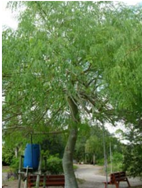
Fig 15. A Moringa stenopetala tree at ECHO (Florida).