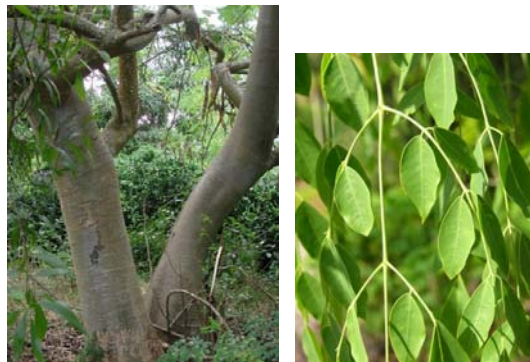
Fig 16. Trunk and leaves of Moringa stenopetala .

Compared with M. oleifera , the trunk of M. stenopetala is considerably thicker at the base, the tree seems more vigorous, the leaves are larger, and if tasted raw the leaves are milder (Fig. 16). Dr. Jahn says that in the Sudan M. oleifera develops into a slender tree, M. stenopetala into a round shrub-like tree.