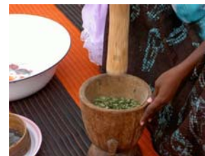
Fig. 4. Pounding moringa leaves to make leaf powder.

the water or boiling the leaves more than once. In addition, making sauces with leaf powder instead of fresh leaves appears to be quite popular because it saves time and is easy to use." (Fig. 4)