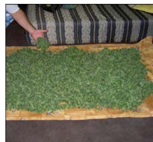
Fig. 2. Moringa leaves spread out to dry.

Moringa leaves can be easily dried (Fig. 2). Leaves should be dried in the shade to reduce loss of vitamins, especially vitamin A. AVRDC research showed that most nutrients were retained by drying at 50°C (122°F) for 16 hours. The brittle leaves are then pounded and sifted to remove leaf stems. Leaves can also be rubbed over a wire screen to make a powder, which should be stored in a sealed, dark container. The powder can conveniently be added to soups, sauces, porridges, baby food, etc. "It is estimated that only 20-40% of vitamin A content will be retained if leaves are dried under direct sunlight, but that 50-70% will be retained if leaves are dried in the shade." "One rounded tablespoon (8 g) of leaf powder will satisfy about 14% of the protein, 40% of the calcium, 23% of the iron and nearly all the vitamin A needs for a child aged 1-3. Six rounded spoonfuls of leaf powder will satisfy nearly all of a woman's daily iron and calcium needs during pregnancy and breast-feeding."