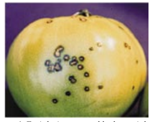
Figure 4. Fruit lesions caused by bacterial canker.