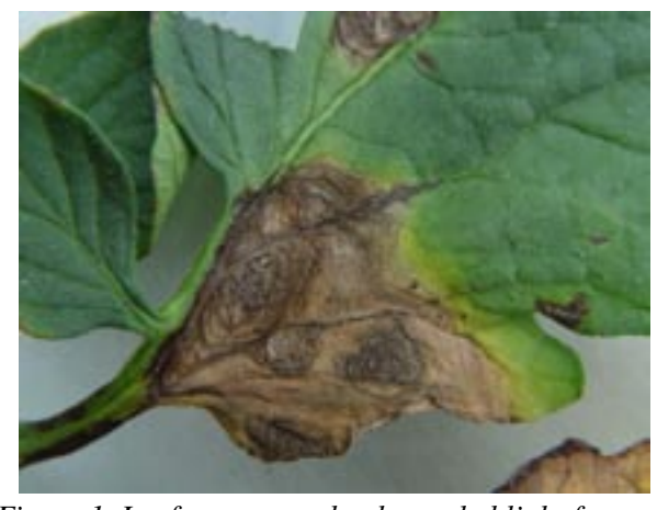
Figure 1. Leaf spot cause by the early blight fungus.

The early blight fungus is spread by wind and insects. The fungus overwinters in crop debris and on seeds and can probably survive several years in the absence of a host.