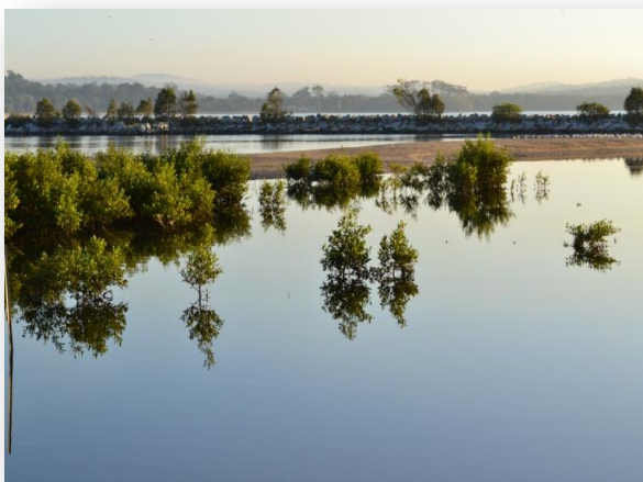
Warrigal Greens can be found in coastal areas of much of southern Australia and also grow on the edges of inland salt marshes.

It is not uncommon now for Warrigal Greens to be used as a replacement for spinach but care should be taken with preparation. Leaves should be blanched in boiling water for at least one minute, cooled in cold, fresh water, and then cooked normally. This process reduces the levels of oxalate.