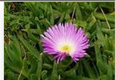
Carpobrotus glaucescens – a more typical member of the Aizoaceae plant family

Tetragonia belongs to the plant family Aizoaceae . You may know some of its close relatives, such as Mesembryanthemum or Carpobrotus (Pig Face) , succulent, hardy plants with 'daisy-like' flowers.