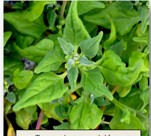
Tetragonia tetragonioides – Warrigal Greens, New Zealand Spinach or Botany Bay Spinach

Tetragonia tetragonioides is a leafy ground cover plant, widely dispersed around the Australian coastline and through much of inland eastern Australia, most commonly along the coast and along the edges of inland salt marshes. It is also widespread around the Pacific including New Zealand, Chile, Argentina and Japan; it has become an invasive plant in both North & South America and is cultivated in South-east Asia.