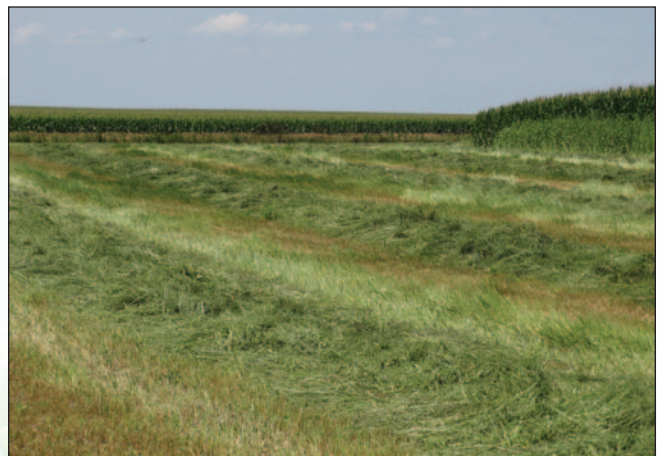
Windrows of Teff in corners of irrigated field

Farmers in irrigated areas using center pivots have been successful in utilizing Teff to obtain some production in the dryland corners. These plantings can be successful if there is adequate soil moisture at planting time for germination and establishment. Once established, Teff's low water requirement and subsequent drought tolerance has the potential of providing growers with additional hay production for on farm use or hay sales.