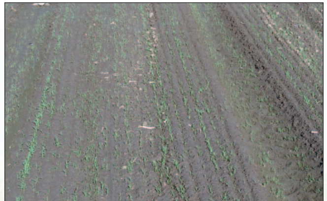
Uneven emergence due to a loose seed bed at planting

Planting Teff in a firm seed bed helps in proper seed placement and reduces the chance of burying the seed too deeply with loose soil. It also provides good seed to soil contact allowing for better soil moisture movement to the seed. Teff plantings in loose seed beds can often be identified by quicker seedling emergence in the wheel tracks of the planter, than in the rest of the field.