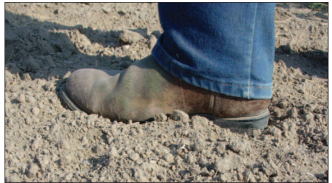
Improper seed bed preparation

Planting Teff in a firm seed bed helps in proper seed placement and reduces the chance of burying the seed too deeply with loose soil. It also provides good seed to soil contact allowing for better soil moisture movement to the seed. Teff plantings in loose seed beds can often be identified by quicker seedling emergence in the wheel tracks of the planter, than in the rest of the field.