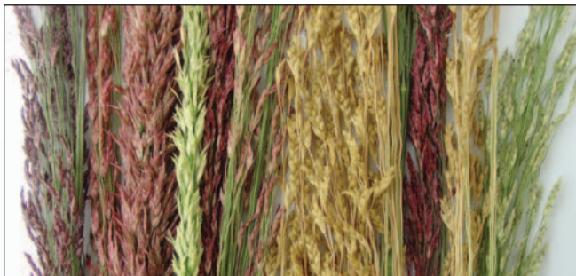
Teff seed heads showing the genetic diversity of the crop worldwide

The word "teff" is derived from the Ethio-Semitic root "tff", which means "lost", possibly a reference to its extremely small seed size.