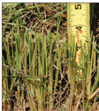
Proper cutting height

Cutting at the proper time (prior to seed head appearance) ensures adequate plant reserves for regrowth in subsequent cuts. Harvesting after Teff has headed out will cause delays in regrowth and may severely reduce subsequent forage production. Cutting interval is generally 45 to 50 days for first cut and approximately 30 days for subsequent cuts; however this may vary by location. In the event of lodging due to weather, harvest immediately to prevent potential stand loss from plant smothering. A stubble cutting height of no less than 4 inches is recommended to promote vigorous regrowth. Plant food reserves that fuel regrowth are stored in the bottom 4 inches of the plant stem. Therefore cutting heights lower than 4 inches will severely reduce subsequent forage production. Windrows should not be left in field for extended times, or stand loss will occur under the windrows.