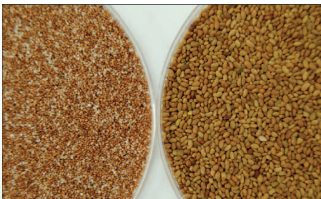
Raw Teff seed on the left at 1.3 million seeds per pound and alfalfa seed on the right with 220,000 seeds per pound.

Teff is a very small seeded annual grass with an average of 1.3 million seeds per raw pound. For this reason coated seed is usually preferred by growers so most planting equipment can handle Teff seed. Some seed coatings are now colored, which aids growers to visually check for coverage and depth of planting.