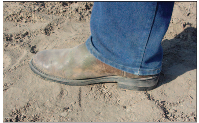
Proper seed bed preparation