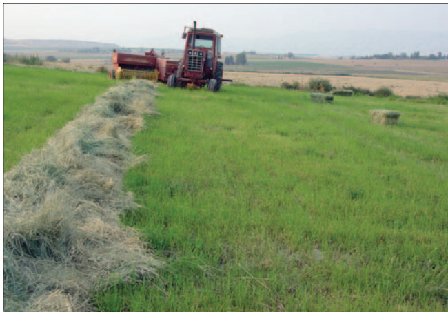
Windrows of Teff and note fast recovery after cutting

Harvest as dry hay will maximize forage production and return per acre. Hay making can be accomplished using normal harvest equipment for grass hay, however rotary mowers are preferred. Due to the fineness of its stems, Teff is one of the few annual forage crops that is suitable for making dry bales rather than having to ensile it. Windrows should not be left in the field for extended times since plants under the windrow may be damaged by delayed harvest.