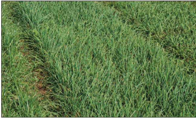
Seeding with no herbicide applied

If weed control is needed during stand establishment, several management practices can be useful. A pre-plant cultivation can be effective, especially if Teff is planted immediately after cultivation.