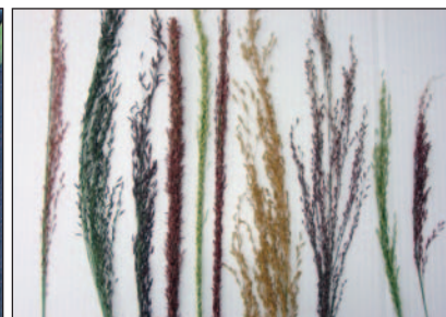
Teff grass panicles