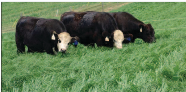
Cattle grazing in Teff

Grazing Teff planted in sandy soils may be more difficult than in heavier soils since plants are easier to pull out of sandy ground. In those cases, harvesting for hay might be advised in the early season and grazing after the last cutting. Prussic acid or nitrate toxicity in Teff forage has not been observed on late season grazing or after a frost.