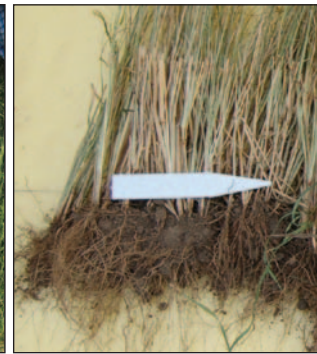
Dense fibrous roots