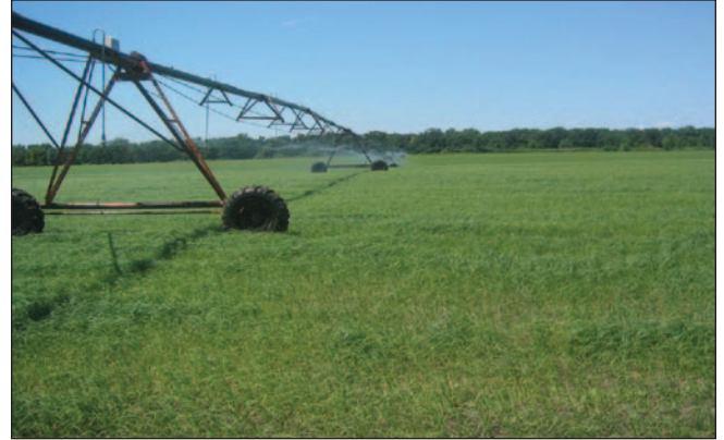
Teff under irrigation