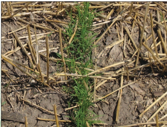
Teff seedlings in wheat stubble

Because Teff can be planted from late spring to mid-summer, it is a good double cropping option following cereal grain crops such as wheat. When double cropping Teff after wheat on the Central and Southern Plains, growers should avoid no-filling into overly tall stubble or over-working dry soils. Teff must be planted no deeper than 1/4 inch and can not be "planted to moisture". Grower reports indicate poor stand establishment when Teff follows triticale due to a possible allelopathic interaction. Teff hay has a higher profit potential than many alternatives due to its high yield and high quality.