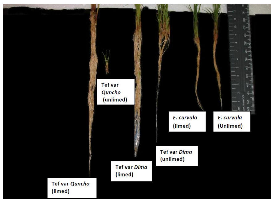
Fig 2. Root length E. tef varieties and E. curvula var Ermelo grown in limed and unlimed acid soil.

a Means in the same column followed by the same letter are not significantly different at p=0.05. b ARL-Average root length; ASHL-Average shoot length; RDW-Root dry weight; SHDW-Shoot dry weight