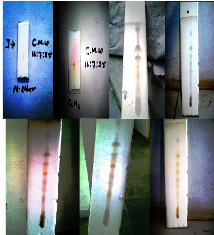
Figure 2.1 Thin layer chromatography qualitative analyses of six fractions against Colocasia esculenta plant tuber extract.

Source of support: Nil, Conflict of interest: None Declared