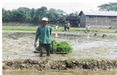
Careful handling of seedlings.