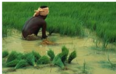
Traditional pulling of seedlings at 20-30 DAS.