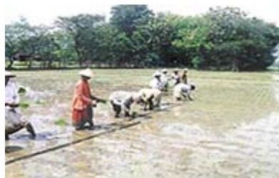
Transplanting seedlings in puddled, leveled field.