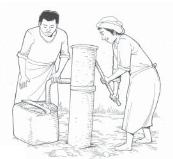
Domestic and industrial users also benefit from recharged groundwater.

Head-tail differences are minimized: during the monsoon, there is enough water for users at the tail end of the irrigation system, and there is still plenty to recharge the aquifer. During the dry season, as there is no canal supply, all the farmers have to pump water if they want to irrigate a post-monsoon crop. Since pumping costs farmers money, they use the water more efficiently.