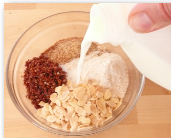
Quinoa in pancake batter