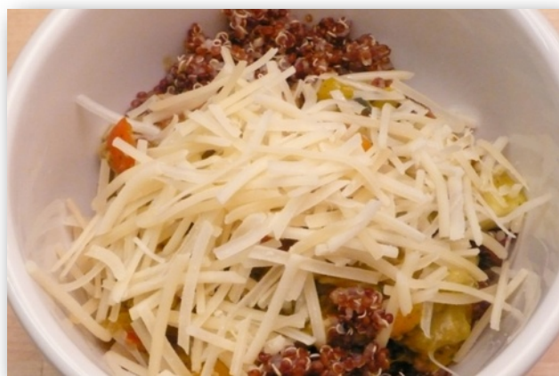
Quinoa with tomato sauce and Parmesan cheese