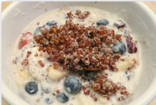
Quinoa with yogurt and fresh fruit

Quinoa works great as a flavorful and highly nutritious substitute for pasta, rice or any other grain. It even works well in place of or along with morning cereal. Here are only three suggestions. As mentioned at the beginning of this recipe, your imagination is your only limit.