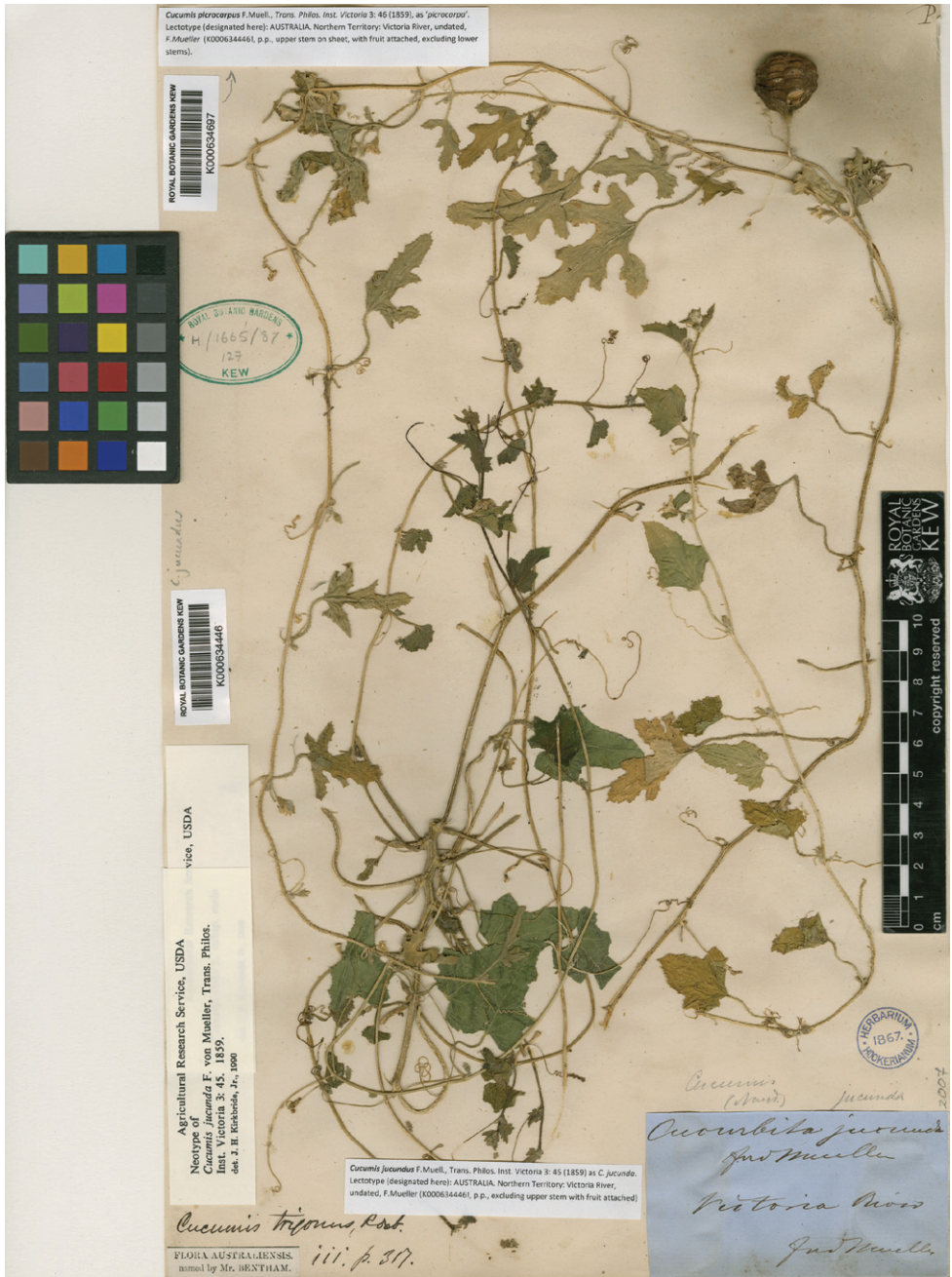
Figure 1. The Kew sheet K000634697 and K000634446 with the mixed collection of two species of Cucumis collected by Ferdinand von Mueller in Australia. The stem with the deeply lobed yellowish leaves and the attached fruit is the lectotype of Cucumis picrocarpus F. Muell., while the branch with the more green and much less lobed leaves is the lectotype of Cucumis jucundus F. Muell.