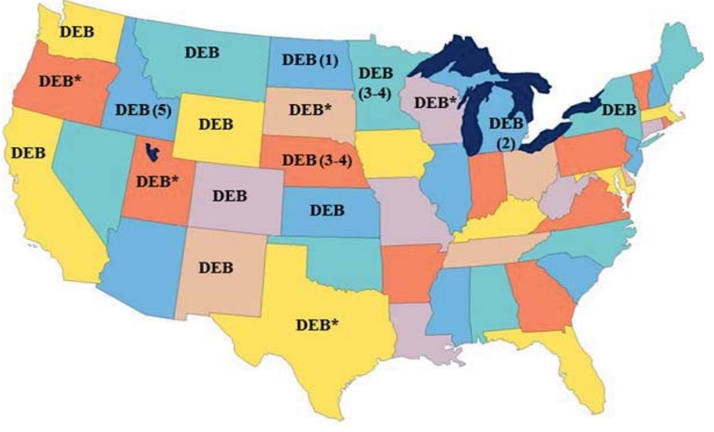
Figure 2. States that produce dry beans [9].

New York was the first US state on record to grow dry beans and was the leading producer from the 1800s until the early 1900s when Michigan assumed this position. Commercial production of dry beans is now scattered across 19 states with North Dakota, Michigan, Nebraska, Minnesota and Idaho being the leaders relative to total yields (Figure 2). These states have remained in the top five positions for the last decade with Nebraska and Minnesota switching in the 3rd and 4th ranking depending on the year. Typically, Nebraska exceeds the other top ranking states in yield per acre. According to the USDA 2010 statistics [8], Nebraska produced on average 910 kg/acre (2010 lbs/acre) of dry beans followed by Idaho (860 kg/acre, 1900 lbs/acre), Michigan (820 kg/acre, 1800 lbs/acre), and North Dakota (657 kg/acre, 1490 lb/acre). Pinto beans account for the largest market class produced in the US and are grown in most of the dry bean growing states (Figure 2) with the navy and black beans following a distance 2nd and 3rd [4,9,10] (Figure 1).