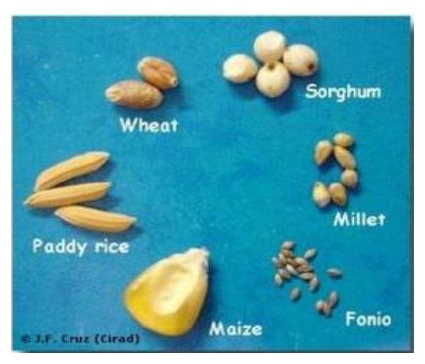
Figure 2. Fonio (acha and iburu) with other cereal grains (Anonymous, 2006).

cardiovascular benefits (Pasupuleti and Anderson, 2008).