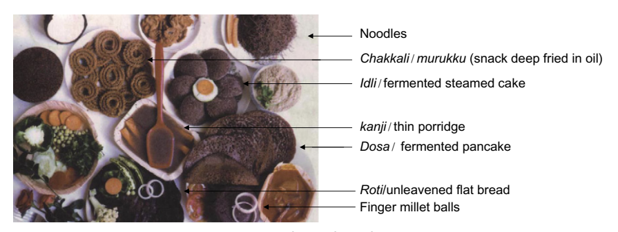
Figure 1.1 Prominent traditional Indian foods from finger millet.

In India, usually finger millet is pulverized and the whole meal is utilized for the preparation of traditional foods, such as roti (unleavened flat breads), kazhi (finger millet balls), and kanji (thin porridge) (Fig. 1.1; Shobana, 2009). In addition to these traditional foods, finger millet is also processed to prepare popped, malted, and fermented products. The nonconventional products from finger millet are papads (rolled and dried preserved product), noodles, soup, etc. Recently, decorticated finger millet has been developed. The details of the different processing are presented in Fig. 1.2 (Malleshi, 2007; Rejaul, 2008; Shobana, 2009; Shobana & Malleshi, 2007; Ushakumari, 2009), and the nutrient composition of different finger millet products is presented in Table 1.2. A brief account of the nature of processing and the quality characteristics of the products are given below.