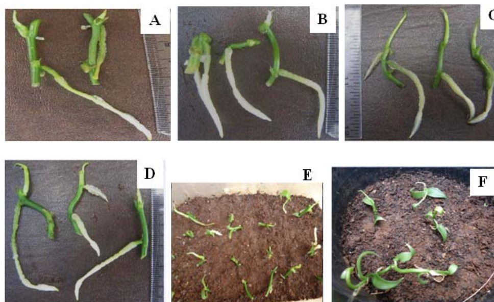
Fig. 3: In vitro rooting ability of vanilla on media supplemented with different gelling agents and acclimatization in greenhouse, A) Agar (0.8%) was used as a control, B) the composite was mixture of agar (0.2%) and bulla (6%). Two different concentrations of bulla, (C) 8% and (D) 10% were used separately. Rooted plantlets were acclimatized for, (E) 15 days and (F) 60 days on soil in greenhouse

*: 17.20 ETB ~ 1 $; Composite: 6% bulla + 0.2% agar ; Conc.: Concentration