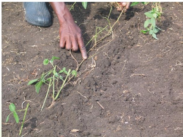
Fig. 3. Planting Vines