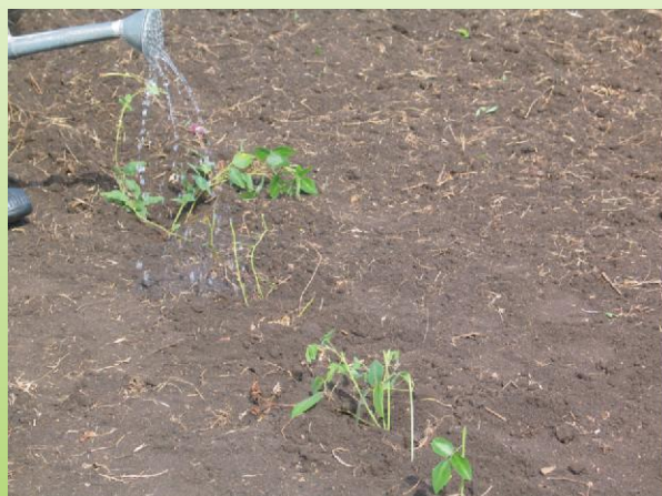
Fig. 4. Watering Planted Vines