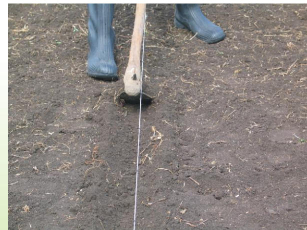
Fig. 2. Making Furrow for Planting Vines

Mark the rows, 75cm apart using strings. Using a hoe, make a furrow 2 cm deep along the strings (FIG. 2).