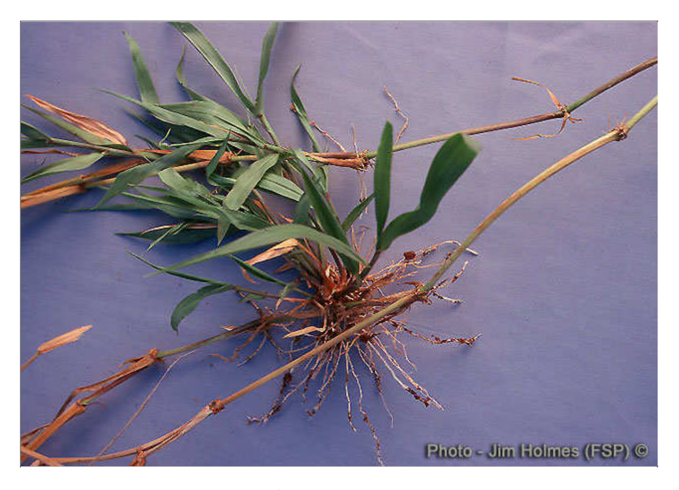
Spreads by stolons.