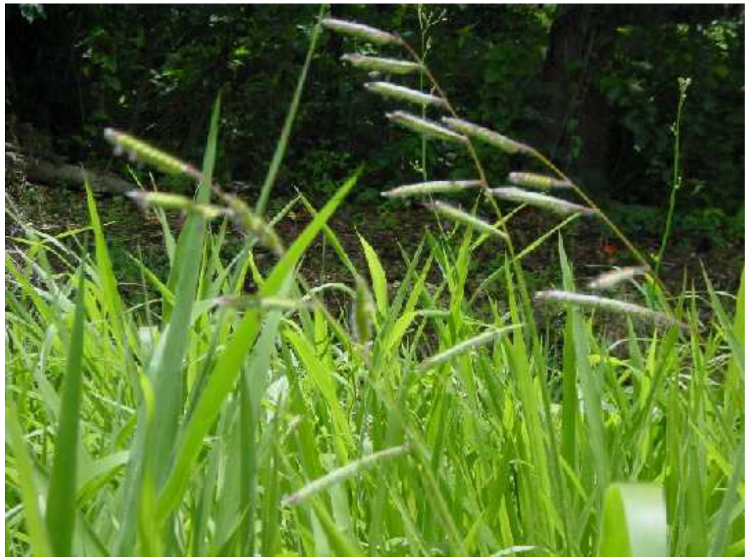
Congo signal grass, Tengeru, Tanzania