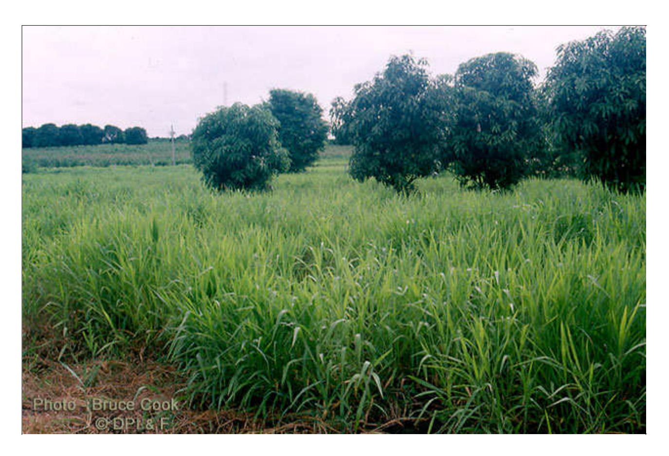
Forms a dense leafy cover in fertile situations.