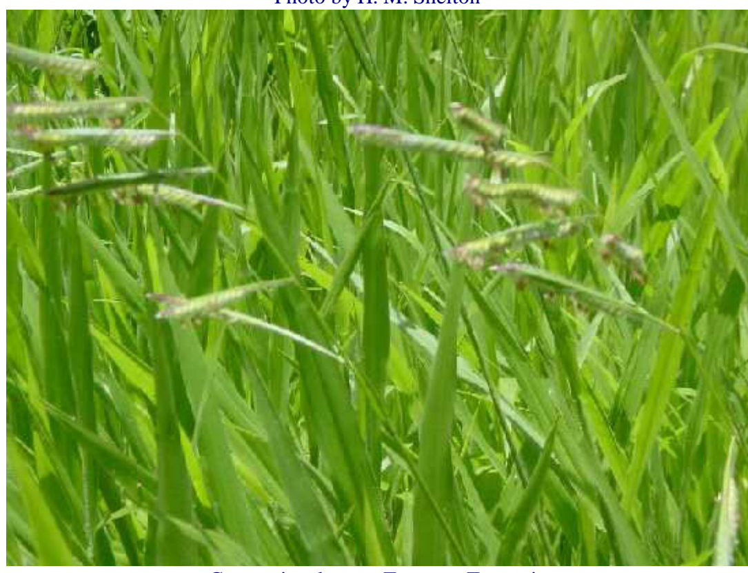
Congo signal grass, Tengeru, Tanzania