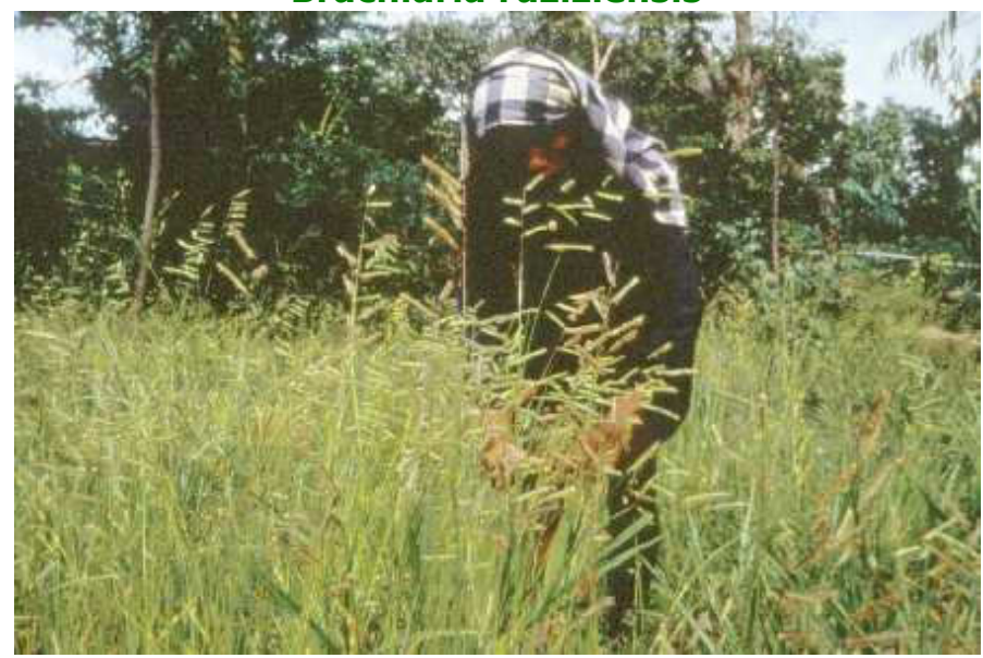
Brachiaria ruziziensis seed being collected by hand in Northeast Thailand