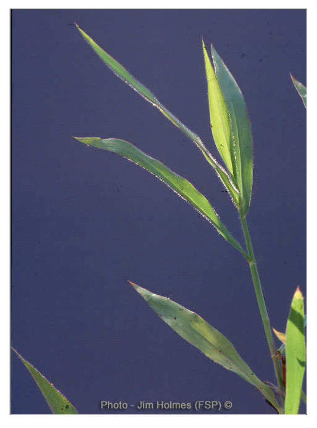
Soft hairy leaves.