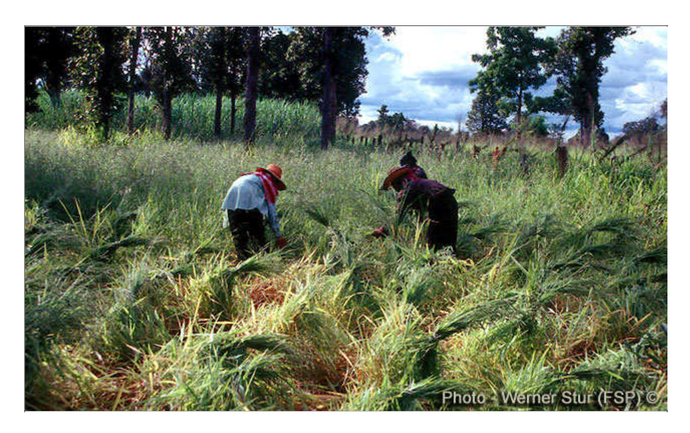
Harvesting seed in Thailand.