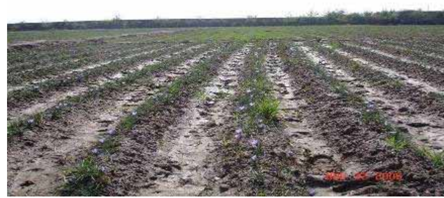
Ridge planting method (Herat Province, Afghanistan)