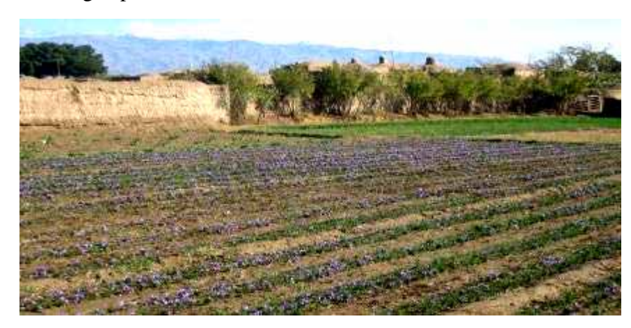
Flat bed planting method (Herat Province, Afghanistan)