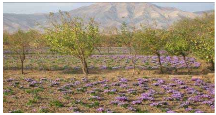
Traditional pit planting method (Herat Province, Afghanistan)