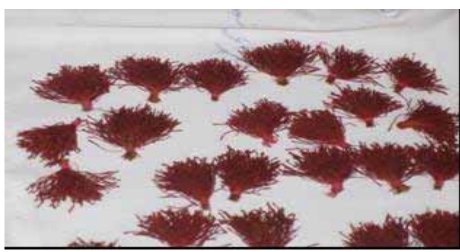
Saffron stigma arranged in bundle and ready for drying.