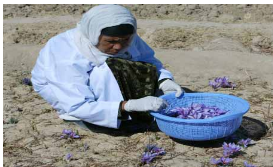
Saffron flower harvesting (Herat Province, Afghanistan)