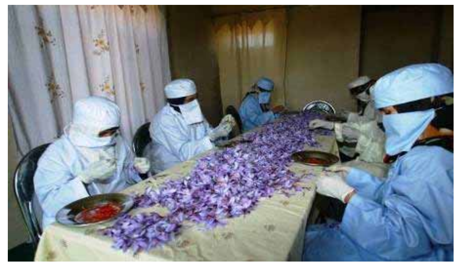
Separation of stigma from flowers (Herat Province, Afghanistan)