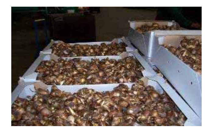
Corm packaging for transport to the field

Corm packaging and transport: Saffron corm packaging and transportation to new fields should be done very carefully. Plastic or carton boxes are suitable. A maximum load of 15 - 17 kg per box is optimal.