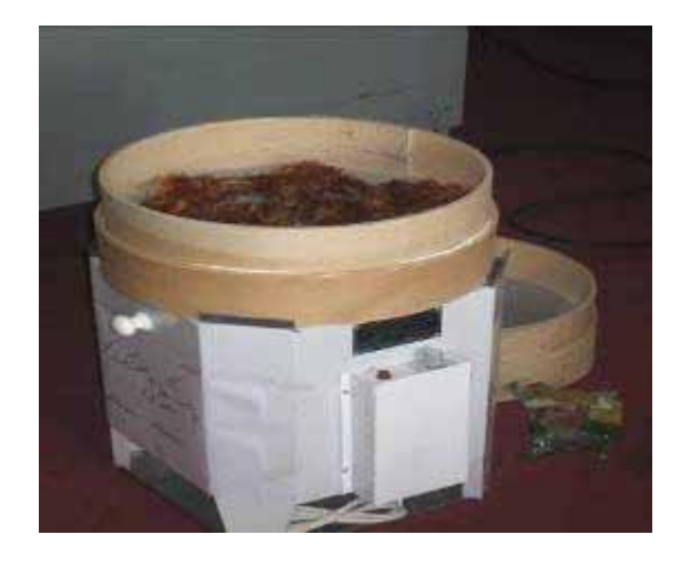
Saffron electric dryer introduced recently in Herat Province, Afghanistan