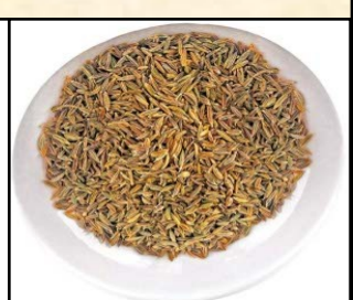
Small cumin big benefits

Cumin has remarkable amount of calcium (above 900 mg per 100 grams) which accounts to over 90% of our daily requirement of calcium. Moreover, cumin is said to help ease and increase secretion of milk in lactating women due to presence of Thymol, which tends to increase secretions from glands, including milk which is a secretion from mammary glands. It is more beneficial if taken with honey. Cumin seeds, when taken along with milk and honey, prove extremely healthy for pregnant women.