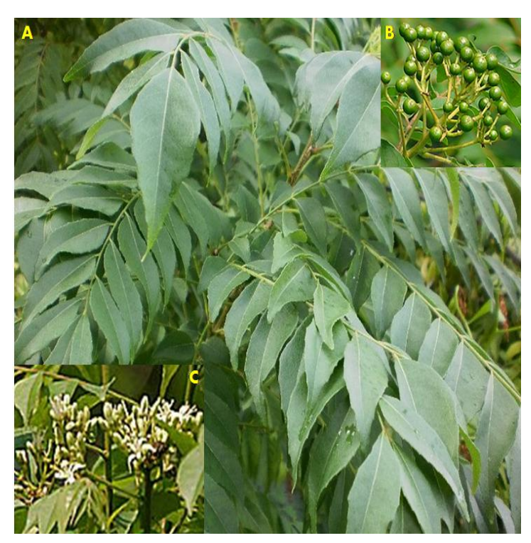
Fig 1: Morphology of Murraya koenigii plant A, along with Fruits B and Flowers C.

Murraya Koenigii, belongs to the family Rutaceae, commonly known as curry-leaf tree, is a native of India, Sri Lanka and other south Asian countries. It is found almost everywhere in the Indian subcontinent, it shares aromatic nature, more or less deciduous shrub or tree up to 6 m in height and 15-40 cm in diameter with short trunk, thin smooth grey or brown bark and dense shady crown <sup>5</sup>. Most part of plant is covered with fine down and has a strong peculiar smell. M. koenigii is genus of tree, native to tropical Asia from Himalaya foothill's of India to Srilanka eastward through Myanmar, Indonesia, Southern China and Hainan. The M. koenigii is having grey color bark, longitudinal striatations on it and beneath it white bark is present. Leaves are bipinnately compound, 15-30 cm long each bearing 11-25 leaflets alternate on rachis, 2.5-3.5 cm long ovate lanceolate with an oblique base. Margins irregularly creatate, petioles 2-3 mm long, flowers are bisexual, white, funnel shaped sweetly scented, stalked, complete, ebracteate, regular with average diameter of fully opened flower being in average 1.12 cm inflorescence, terminal cymes each bearing 60-90 flowers. Fruits are ovoid to subglobose, wrinkled or rough with glands. It is having the size of 2.5 cm long and 0.3 cm in diameter and gets purplish black when ripen. Fruits are generally biseeded. Seeds generally occur in spinach green color, 11 mm long, 8 mm in diameter and weighs up to 445 mg 6