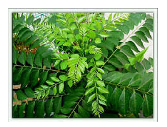
Figure 2.2: M. koenigii tree plant.

Islands and throughout Central and Southeast Asia [17]. The plant was spread to Malaysia, South Africa and Reunion Island by South Asian immigrants. Parts of the plant have been used as raw material for traditional medicine formulation in India [18]. The plant is used in Indian system of medicine to treat various ailments [19-21]. M. koenigii leaves and roots can be used to cure piles and allay heat of the body, thirst, inflammation and itching. The aromatic leaves, which retains their flavour and other qualities even after drying, are slightly bitter, acrid, cooling, weakly acidic in tastes and are considered as tonic, anthelminthic, analgesic, digestive, appetizing and are widely used in Indian cookery for flavouring food stuffs. Below are the figures of M. koenigii tree plant (Figure 2. 2) and leaves (Figure 2.3):