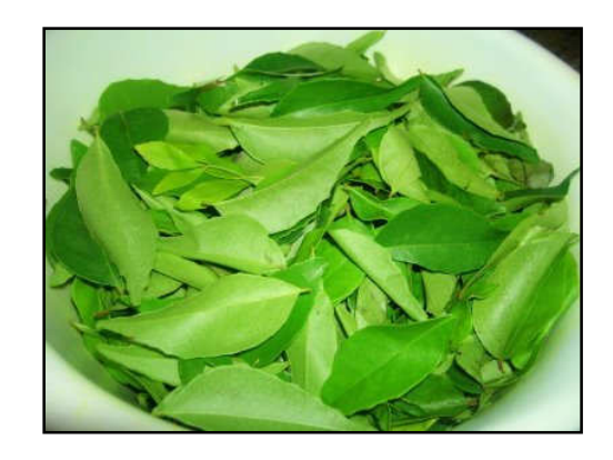
Figure2. 3: M. koenigii leaves.