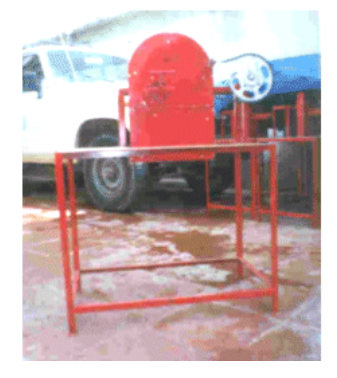
Figure 2: A simple slicing machine used in Bolivia. http://www.fao.org/inpho/content/ compend/text/ch29/ch29_02.htm

The cooked fingers or bulbs are dried until they have a final moisture content of 5-10%. An experienced turmeric processor will know when the rhizome is dry enough as the fingers will snap cleanly with a metallic sound. Traditionally the rhizome pieces are laid on clean concrete floors and dried in the sun. This method can take anything from 10 to 15 days, depending on the climate and the size of the