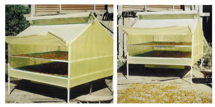
Figure 4: A typical solar drier developed in Bolivia (http://www.fao.org/inpho/content/compend/text/ch29/ch29_02.htm)