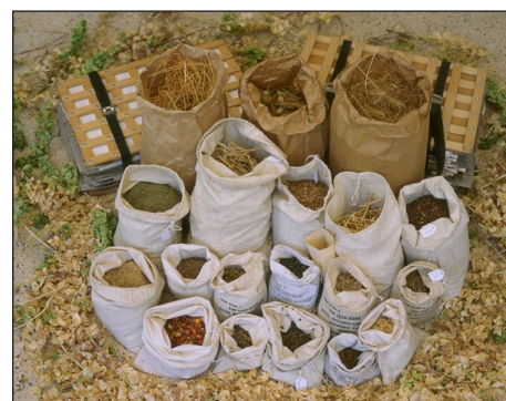
Above: Seed collections in cloth / paper bags