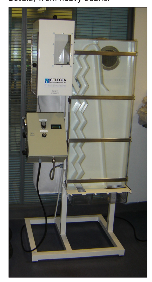
Above: Zig-zag aspirator

Aspirators remove lighter material from a collection such as chaff and empty seeds. Use after sieving or as a procedure on its own. Use reverse aspiration to remove light seed (e.g. Betula ) from heavy debris.