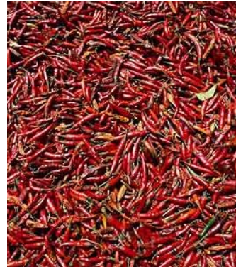
Figure 1: Chillies drying in Sri Lanka.

After winnowing the crop needs to be washed in clean water. All that is needed are two or three 15 litre buckets. For larger quantities a small sink needs to be constructed. This can be made out of concrete. However, the water must be changed regularly to prevent recontamination by dirty water. Only potable water should be used. Take care not to over-wet the chillies or they will take longer to dry.