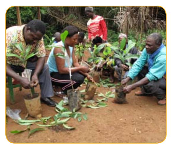
▲ A training session at a rural resource centre managed by PROWISDEV, near Batibo.

However, the farmers who attended training sessions at the pilot nurseries were able to convince others – by example and word of mouth – that domestication would bring real