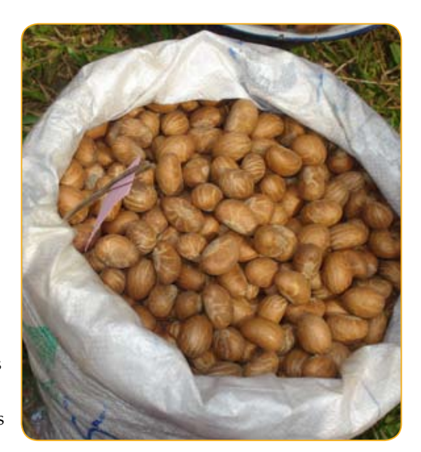
A fine harvest of bitter kola nuts.

Since the World Agroforestry Centre arrived on the scene in 2003, RIBA has helped local farmers' groups to establish 16 satellite nurseries, and most are now producing and selling superior varieties of indigenous fruit tree. Progress in recent years has been rapid. The number of trees planted by individual households rose from 10 to 120 between 2007 and 2008, and these and other activities have led to a significant increase in income. They have also brought considerable benefits to wildlife. "When I arrived here in 1995, the only bird was a warbler," says