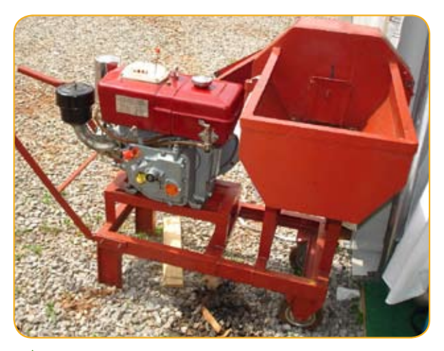
▲ This cracking machine is making it much easier for farmers to process the hard kernels of njansang.

Learning how to propagate and grow superior varieties of indigenous fruit trees is one thing; processing them efficiently and getting good returns in the market place is quite another. Although farmers in Cameroon have been trading indigenous fruits and nuts for generations, processing methods are often laborious and the markets poorly developed.