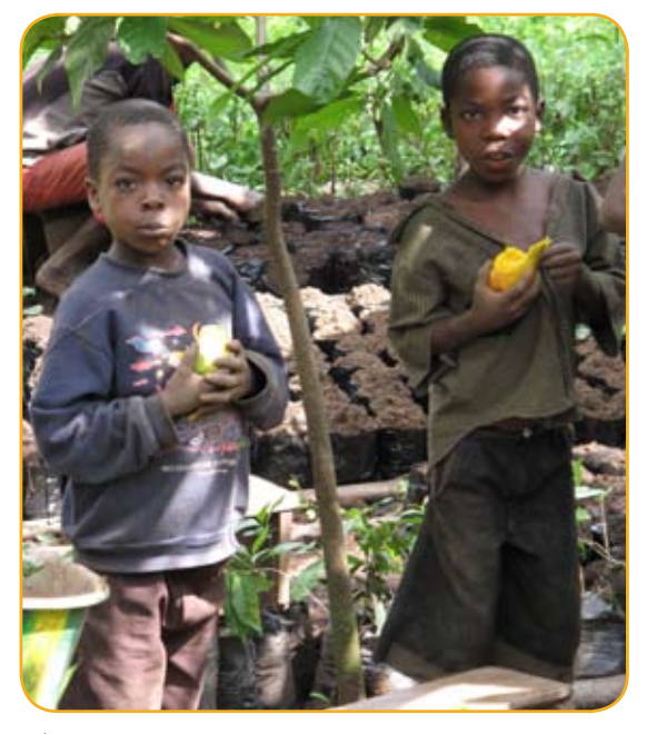
▲ The fruit tree domestication programme is helping to improve the diets of rural children.

In the short term, the World Agroforestry Centre will continue to promote participatory tree domestication in new areas within Cameroon, Ghana, Nigeria and DRC, and it hopes to extend its activities to other countries in West and Central