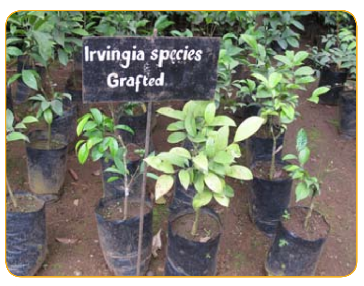
▲ Bush mango seedlings. This species was identified as the highest priority for domestication by farmers in Cameroon and Nigeria.

One of the conventional ways of developing new crop varieties involves sexual reproduction. For example,