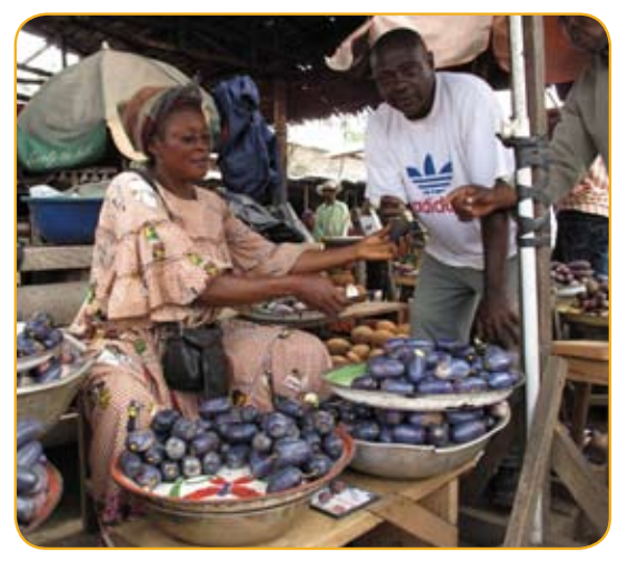
African plums for sale in the market at Makenene East.