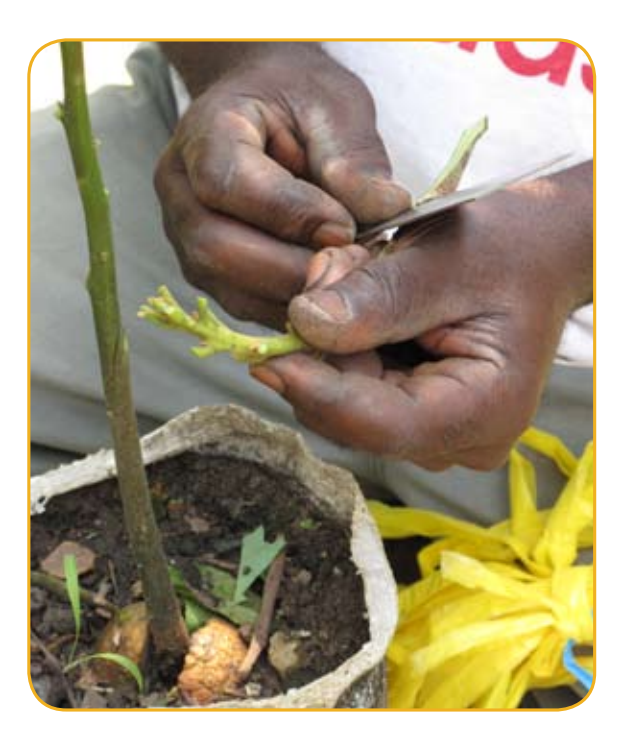
Thanks to the domestication programme, thousands of farmers have mastered propagation techniques such as grafting.

For some species marcotting proved to be an excellent way of establishing clones from sexually-mature wild trees. These could then be used as a source of cuttings or scions for rooting and grafting. Marcotting also reduces the time it takes a tree to reach maturity and bear fruit. "There is a saying round here that if you plant the nut of the cola tree [Cola species], you will die before the first harvest," says Kuh Emmanuel, who manages one of the rural resource centres described in the next chapter. It is still not known how long it takes a wild cola tree to reach maturity probably 20 years or more. However, by using marcots, farmers can raise cola trees that fruit after just four years. What's more, says Emmanuel, these