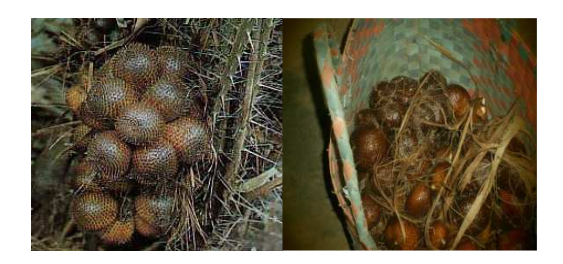
Fig. 1. Salak Pondoh (Salacca zalacca var. Pondoh) Pagar Alam

Nowadays, the production of organic salak salak in Pagar Alam is still limited and can only meet the needs of local consumers. Because of that, it required managing the flow of goods and service named supply chain. Supply chain is a concept that describes the chain of supply flow of material, information and money from the upstream side or the raw material to the downstream side or finished goods [3]. Also, can be said that the supply chain involves all the activities in order to meet the needs of consumers.