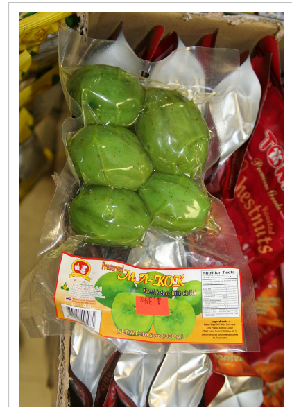
Preserved ma-kok, sweet and sour with chili