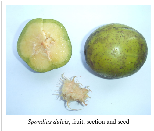
Spondias dulcis , fruit, section and seed

They are deciduous or semi-evergreen trees growing to 25 m tall. The leaves are spirally arranged, pinnate, rarely bipinnate or simple. The fruit is a drupe similar to a small mango (in the related genus Mangifera ), 4-10 cm long, ripening yellow or orange. It has a single seed.