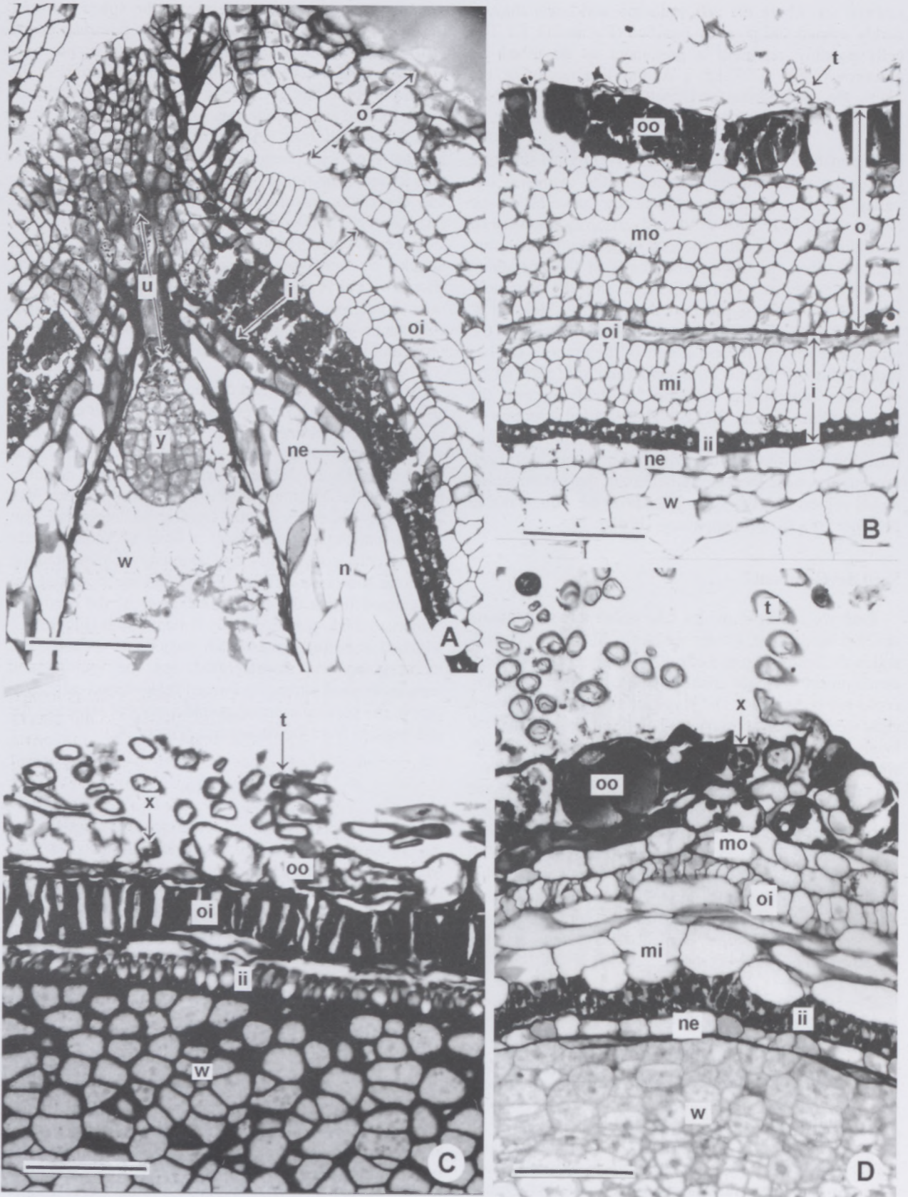
FIGURE 3.—Seed and seed coat formation in Dovyalis caffra . A, micropylar region of young seed with developing embryo, note long suspensor in micropyle; B, l/s developing seed coat; C, l/s seed coat of seed in ripe fruit; D, l/s developing seed coat. i, inner integument (tegmen); ii, inner epidermis of tegmen; mi, mesophyll of tegmen; mo, mesophyll of testa; n, nucellus; ne, nucellus epidermis; o, outer integument (testa); oi, outer epidermis of tegmen; oo, epidermis of testa; o, testa; t, epidermal hair; u, suspensor; w, endosperm; x, guard cell of stoma; y, embryo. All scale bars 10 \mu m.