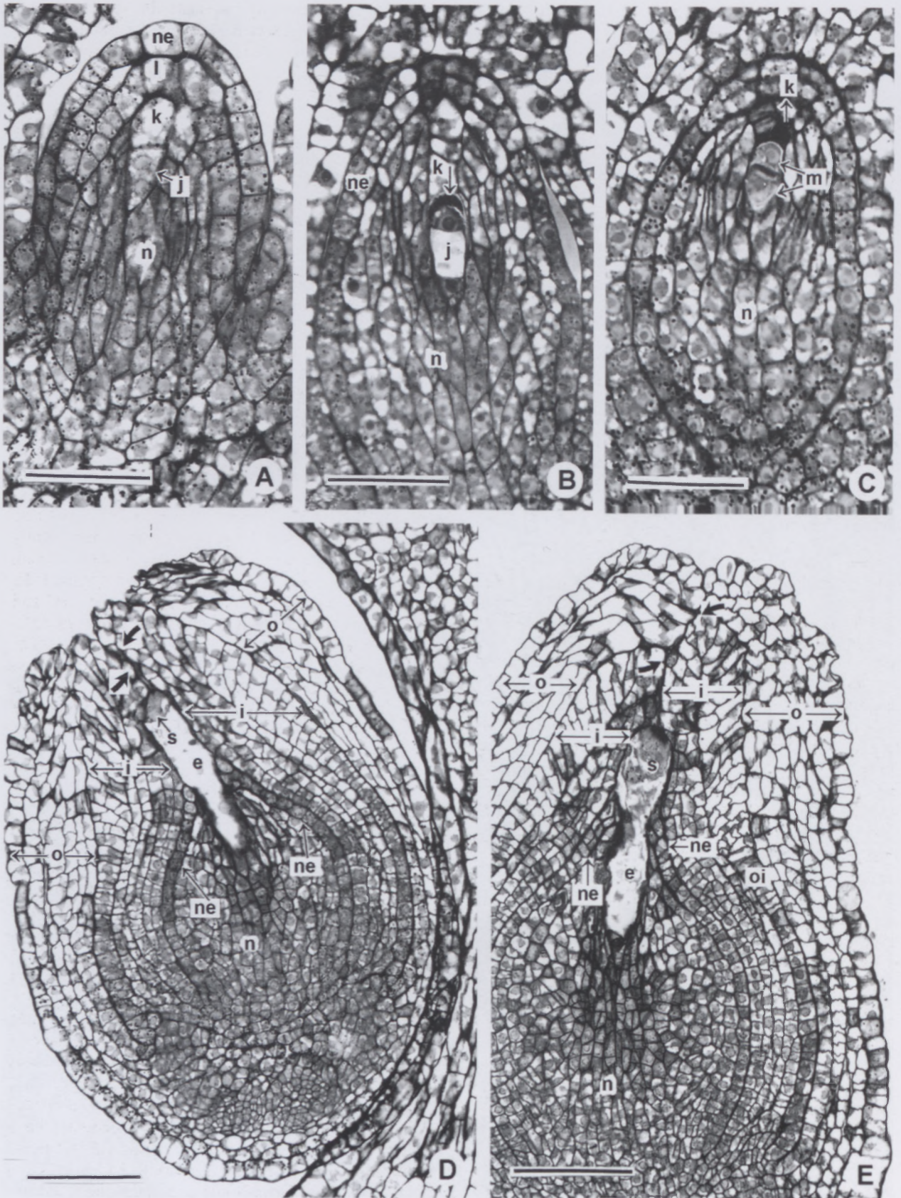
FIGURE 2.—Formation of embryo sac and structure of ovule in Dovyalis caffra . A, dyad cells in nucellus with chalazal cell containing two megaspore nuclei; B, nucellus containing bisporic embryo sac in two-nucleate stage and disintegrated micropylar dyad cell; C, nucellus with two chalazal megaspores and disintegrated micropylar dyad cell; D, structure of ovule at anthesis. Note micropyle (curved arrows) formed by inner integument and embryo sac protruding into lower part of endostome; E, embryo sac at fertilization. Note dark-staining filiform apparatus of synergid, extranuclear embryo sac and slightly skewed micropyle (curved arrows) formed by both integuments. e, embryo sac; i, inner integument; j, initial stage of bisporic embryo sac; k, disintegrated micropylar dyad cell; m, chalazal megaspores; n, nucellus; ne, nucellus epidermis; o, outer integument; oi, outer epidermis of inner integument; s, synergid. Scale bars: A, B, C, 5 \mu m; D, E, 10 \mu m.