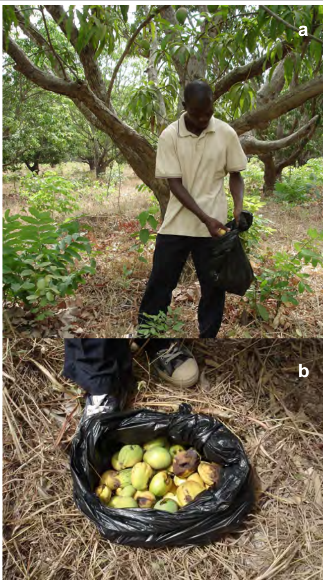
Photos 5 a et b: Collection of fallen fruits into black plastic bags