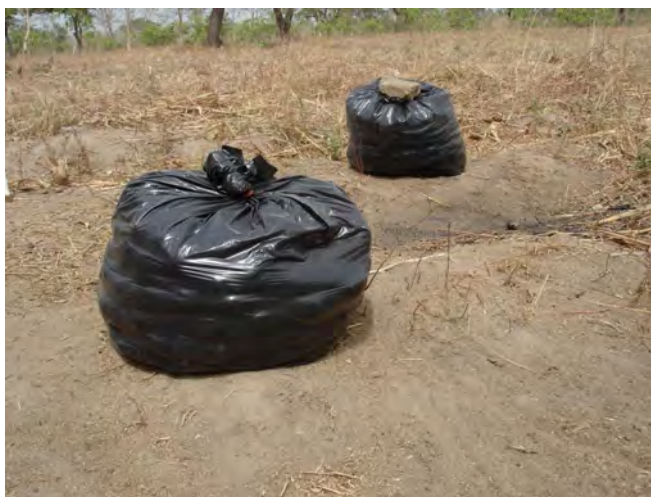
Photo 6: Fallen fruits sealed in black plastic bag and left in the sun

Once emptied, bags should be cleaned for re-use in later weeks provided they are in good condition (i.e. no holes that could allow fly larvae to escape).