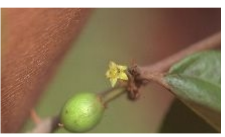
Ziziphus mucronata fruit

Z. mucronata is a hermaphroditic species. In South Africa, flowering is from October to April and fruiting from February to August.