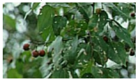
Ziziphus mucronata