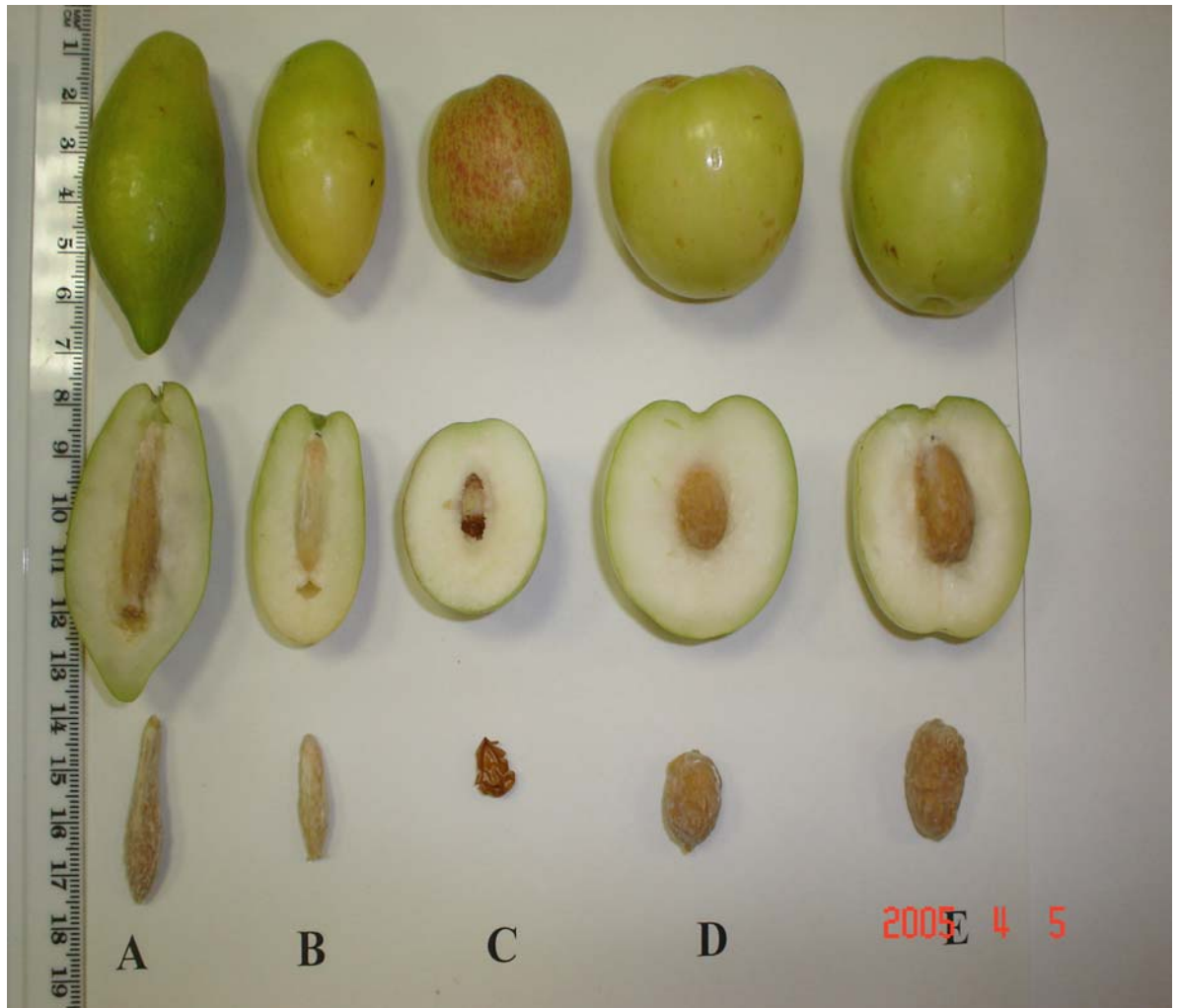
Figure (1): Fruit morphology of the five ber cultivars; A= Komethry, B= Pakstany, C= Um- sulaem, D= Toffahy and E=Peyuan

higher than other cultivars, while the least percentage of reduced sugar was showed in the fruits of the cultivar Um-suleam (4.47 and 4.77%). Meanwhile, the greatest percent of non-reducing sugar was found in fruits of Pakstany cv. and the lowest was in Peyuan.