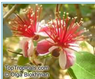
Feijoa sellowiana, Acca sellowiana