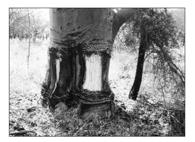
Fig. 5. Stripped bark from the base of a baobab trunk, for making ropes.

Abgezogene Rinde an der Basis eines Baobabstamms, zur Seilherstellung.