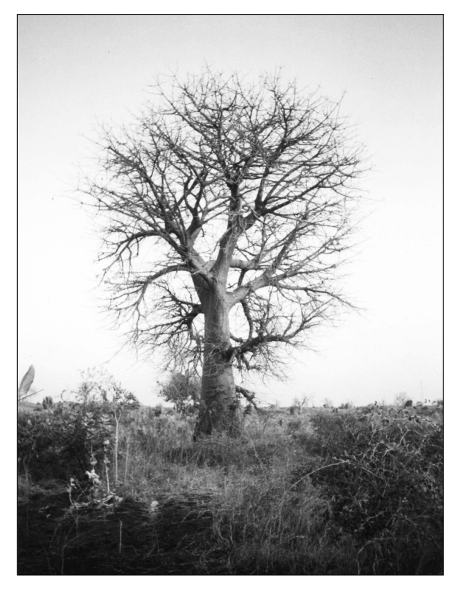
Fig. 1. Baobab tree in the Ed Damazin area (Eastern part of Sudan).

Baobabbaum im Gebiet von Ed Damazin (östlich im Sudan).