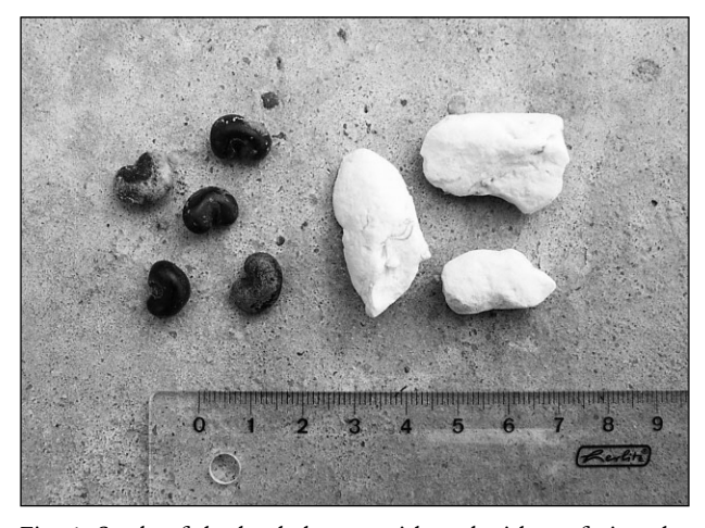
Fig. 4. Seeds of the baobab tree, with and without fruit pulp. Samen des Baobab mit und obne Fruchtpulpe.

According to ADDY and ESTESHOLA (1984) and IG-BOELI et al. (1997), the seed can be classified as both protein- and oil-rich. It is also a very rich source of energy and has a relatively low fat value.