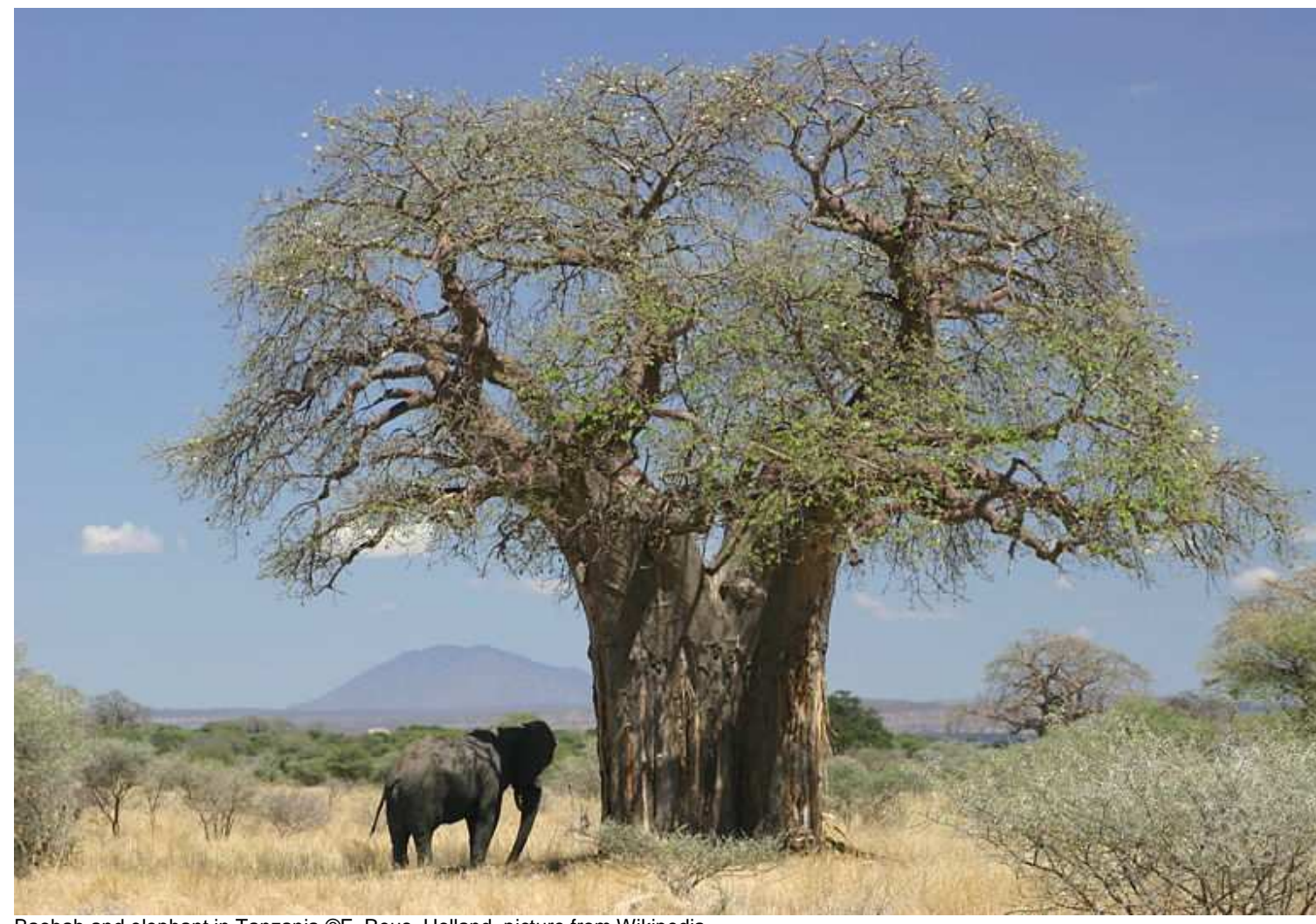
Baobab and elephant in Tanzania