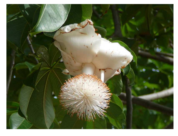
flower and leaf of baobab in Gambia