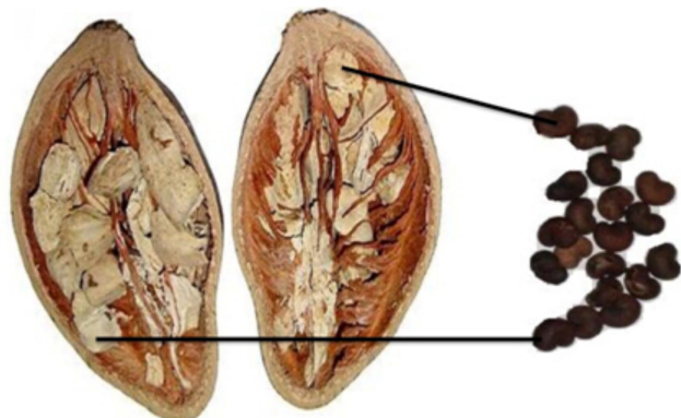
Figure 3. Fruit and seeds of A. digitata .

** : Ascorbic acid compared with oranges of 51 mg/100 g and calcium compared with milk of 125 mg/100 g[35].