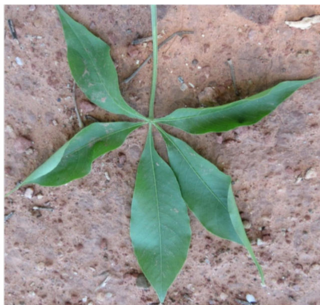
Figure 2. Leaf of A. digitata .

Leaves are 2-3-foliolate at the start of the season and they are early deciduous, of which more mature ones are 5-7(-9)-foliate. Leaves are alternate at the ends of branches or occur on short spurs on the trunk. Leaves of young trees are often simple. Leaflets are sessile to shortly petiolulate with great variation in size. Overall mature leaf size may reach a diameter of 20 cm and the medial leaflet can be 5-15 × 2-7 cm, leaflet elliptic to ovate-elliptic with acuminate apex and decurrent base. Margins are entire and leaves are stellate-pubescent beneath when young becoming glabrescent or glabrous. Stipules are early caducous, subulate or narrowly triangular, 2-5mm long, glabrous except for ciliate margins(Figure 2)[16].