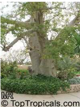
Caudex for bonsai