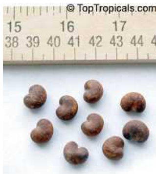
Adansonia digitata (Bombaceae)