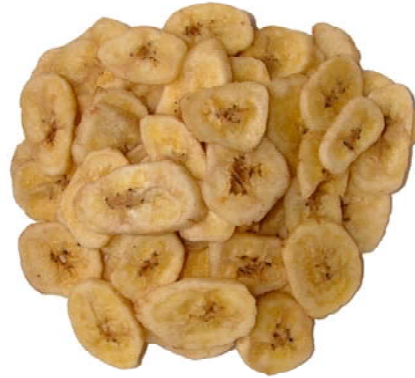
Figure 1: Banana chips.

There are two different methods for making banana chips. One of these is to deep fry thin slices of banana in hot oil, in the same way as potato chips or crisps. The other is to dry slices of banana, either in the sun or using a solar or artificial dryer. The products made by the two methods are quite different. The deep fried chips tend to be a savoury, high calorie product that is eaten as a snack food. Because they are deep fried in oil they have a fairly short shelf life- up to 2 months maximum when stored in the correct conditions. The oil is prone to turning rancid and the crisps to becoming soft if they are not stored in air-tight containers.