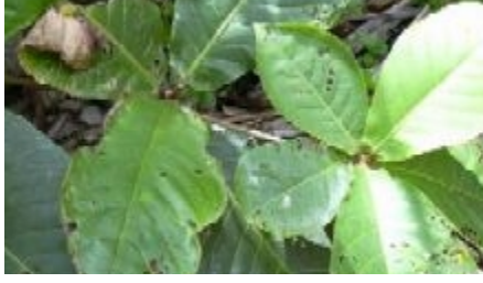
Leaves at Hanawi stream, Maui, Hawaii