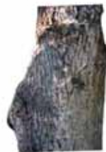
Heritiera littoralis Aiton - Kaharuvah gas