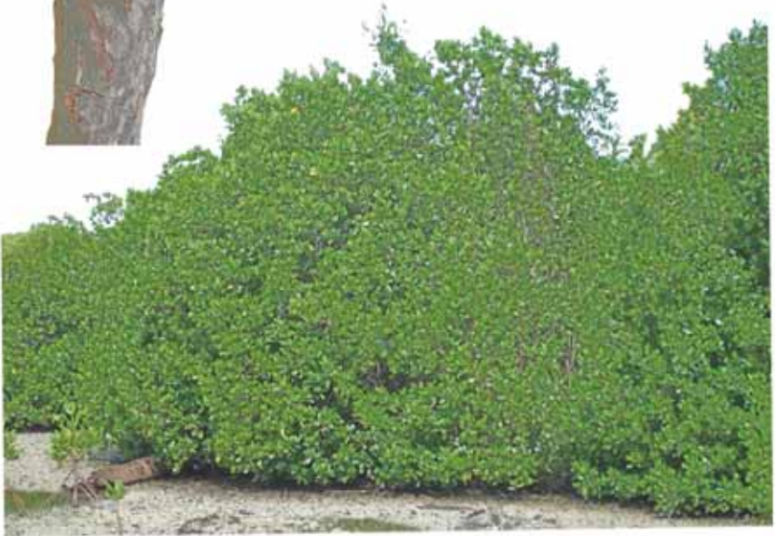
Lumnitzera racemosa - Burevi