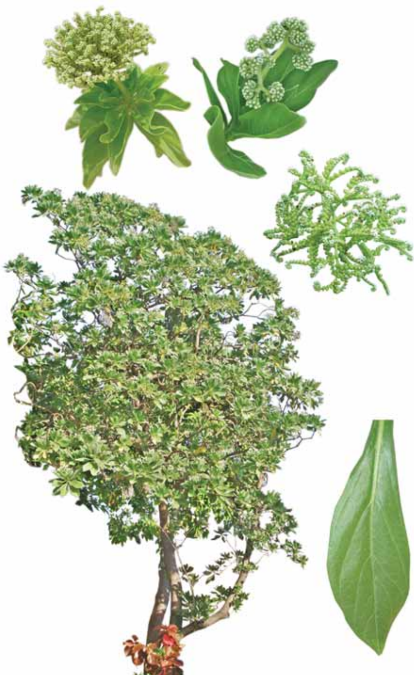
Tournefortia argentea - Boshi