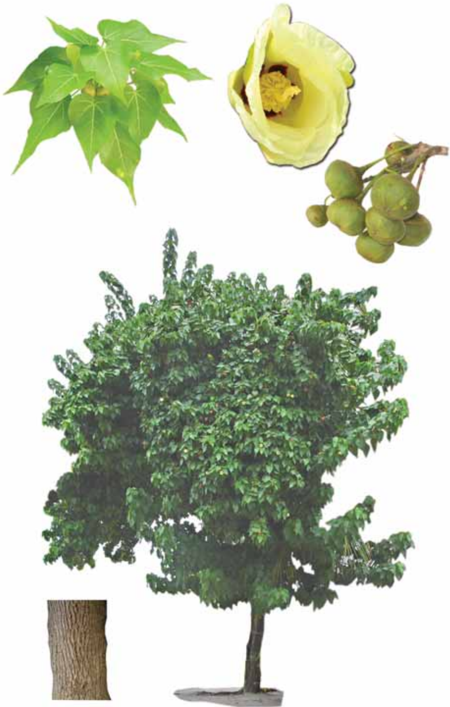
Thespesia populnea - Hirun'dhu