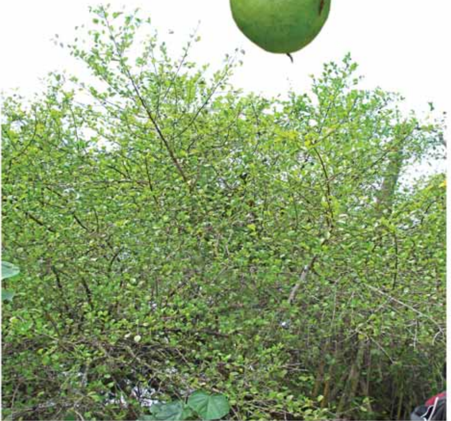
Ximenia americana - En'boo