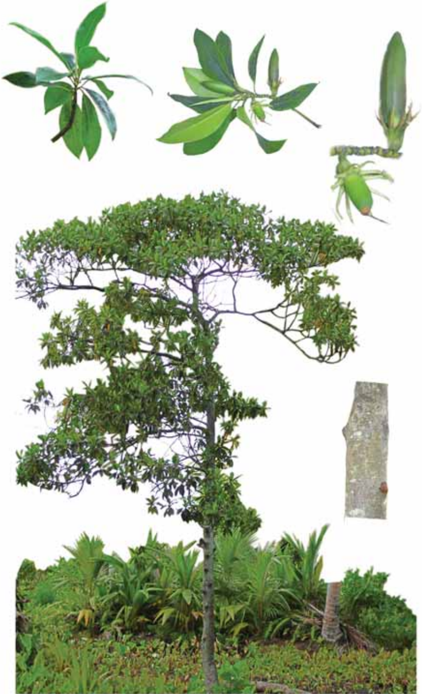
Bruguiera sexangula - Boda vaki