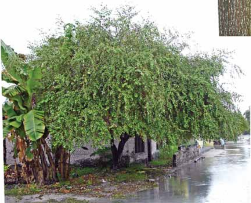
Ziziphus mauritiana - Kunnaaru