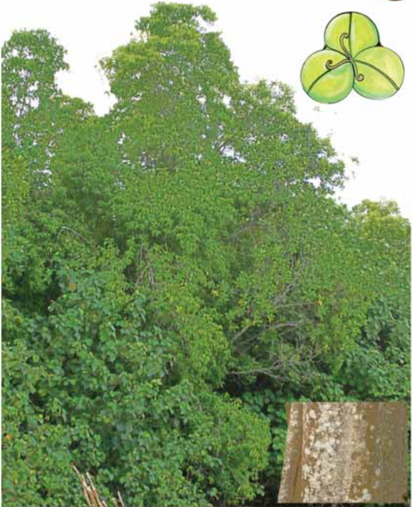
Excoecaria agallocha - Thela