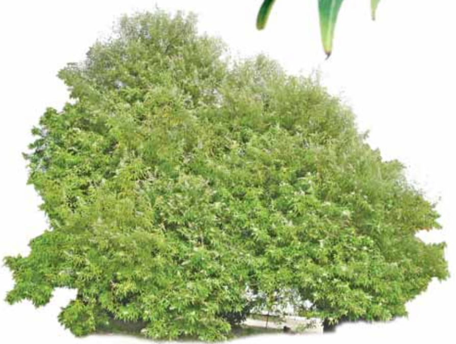
Vitex negundo - Dhunnika