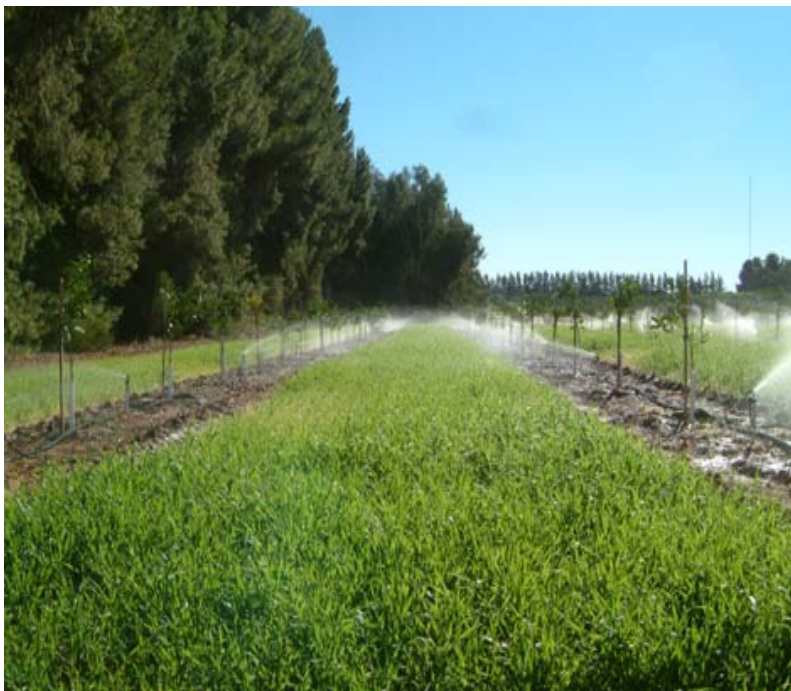
Healthy interrow sod