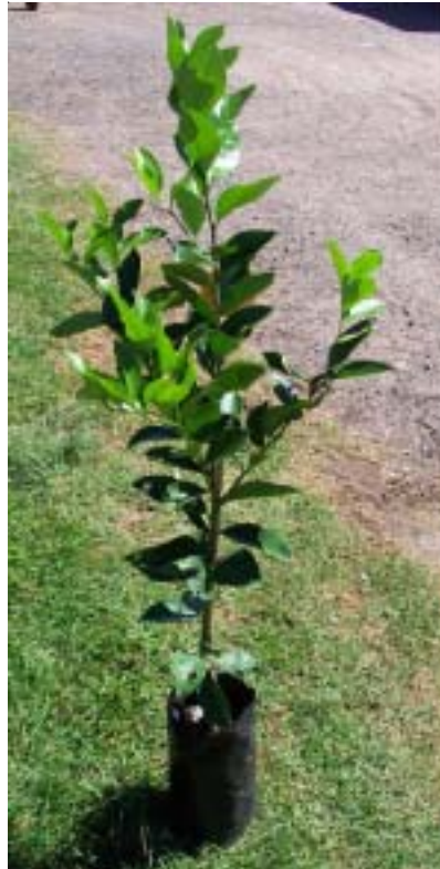
Nursery trees should be in good condition.

For high-performing, true-to-type virus-tested budlines, buy your trees from nurseries that obtain their budwood from Auscitrus. Auscitrus also distributes budwood and seed of newly-imported scion and rootstock varieties. Auscitrus has a range of Fact Sheets on varieties, rootstock seed and budwood. Auscitrus can be contacted on (02) 4325 0247.