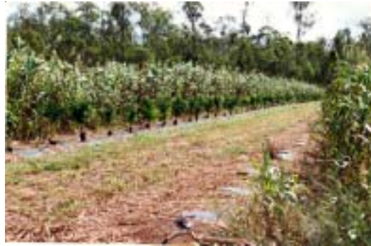
A windbreak using Sudax to protect young trees

For more information on windbreak design refer to the leaflet "Designing Windbreaks for Farms" by Sue Wakefield, 1989.