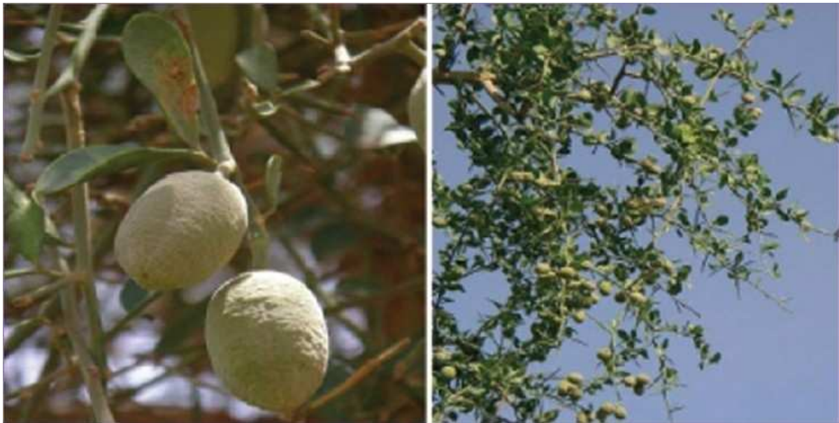
Balanites aegyptiaca Del