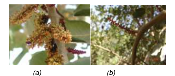
Fig 1.* Female (a) and male (b) flower inflorescences of Ceratonia siliqua trees

*Reference: Photo by Dr Maha Syouf during 22<sup>nd</sup> December 2004 at Wasfi Altal Forest in Jordan.