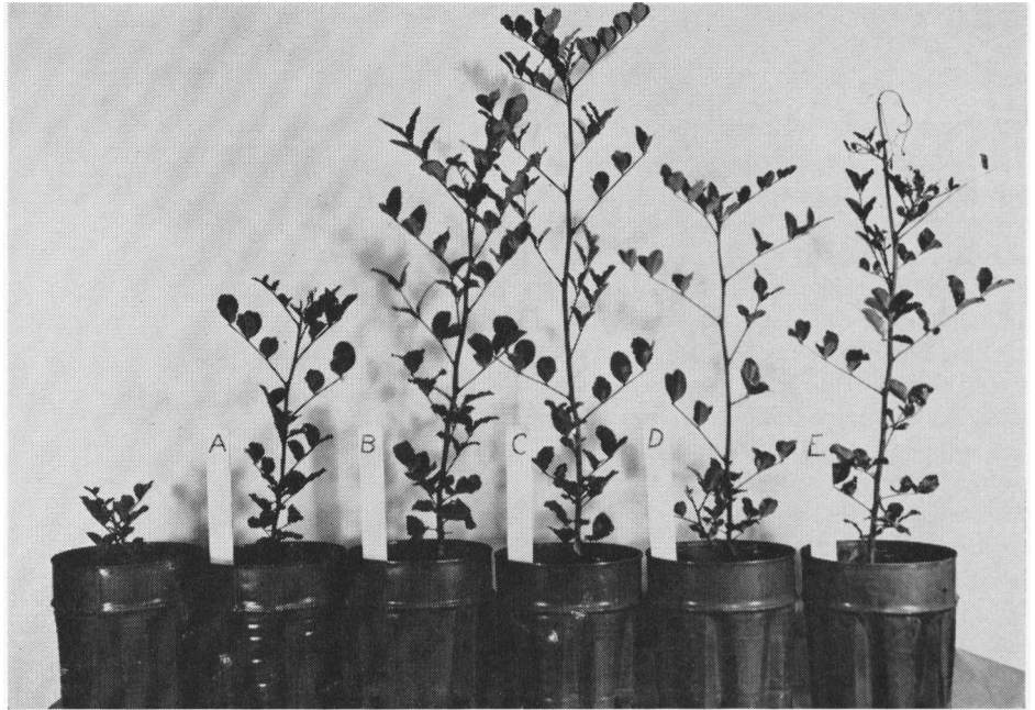
Representative plants at the 30 week observation date. No label—Control, A—100-1T, B—25-1T/M, C—25-2T/M, D—10-2T/M, E—10-1T/W.