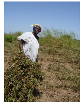
Madame Sall harvesting in Djilor

This group of women commercializes fish produce, local fruit and Palmyra handicraft. "We have worked on our mangrove restoration for the last 12 years and have been able to replant over 100 ha near our village. We need these mangroves for our survival now and for future generations. The handicraft we produce enables me to pay for medicines when someone