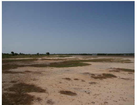
Degraded mangrove area: a possible planting site.

1. Drought: The long period of drought during 1970s and 1980s caused extensive death of mangroves in this region.