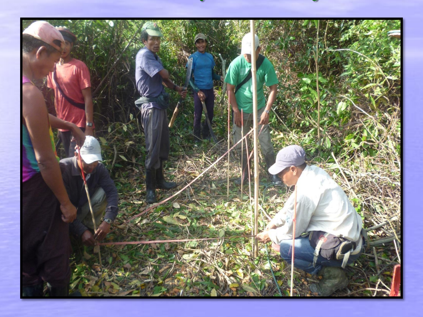
Boundary demarcation in Deedote Island