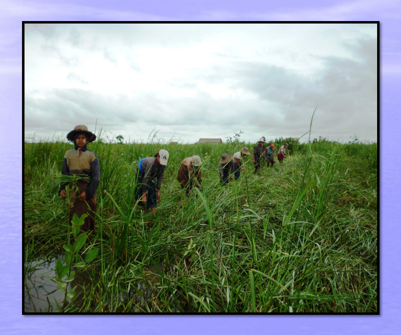
Aye chan thayar Village, Bogalay Township