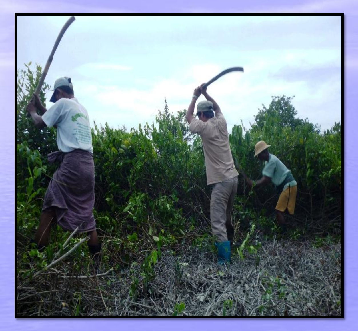
Skill Labours and hardworking in Deedote Island