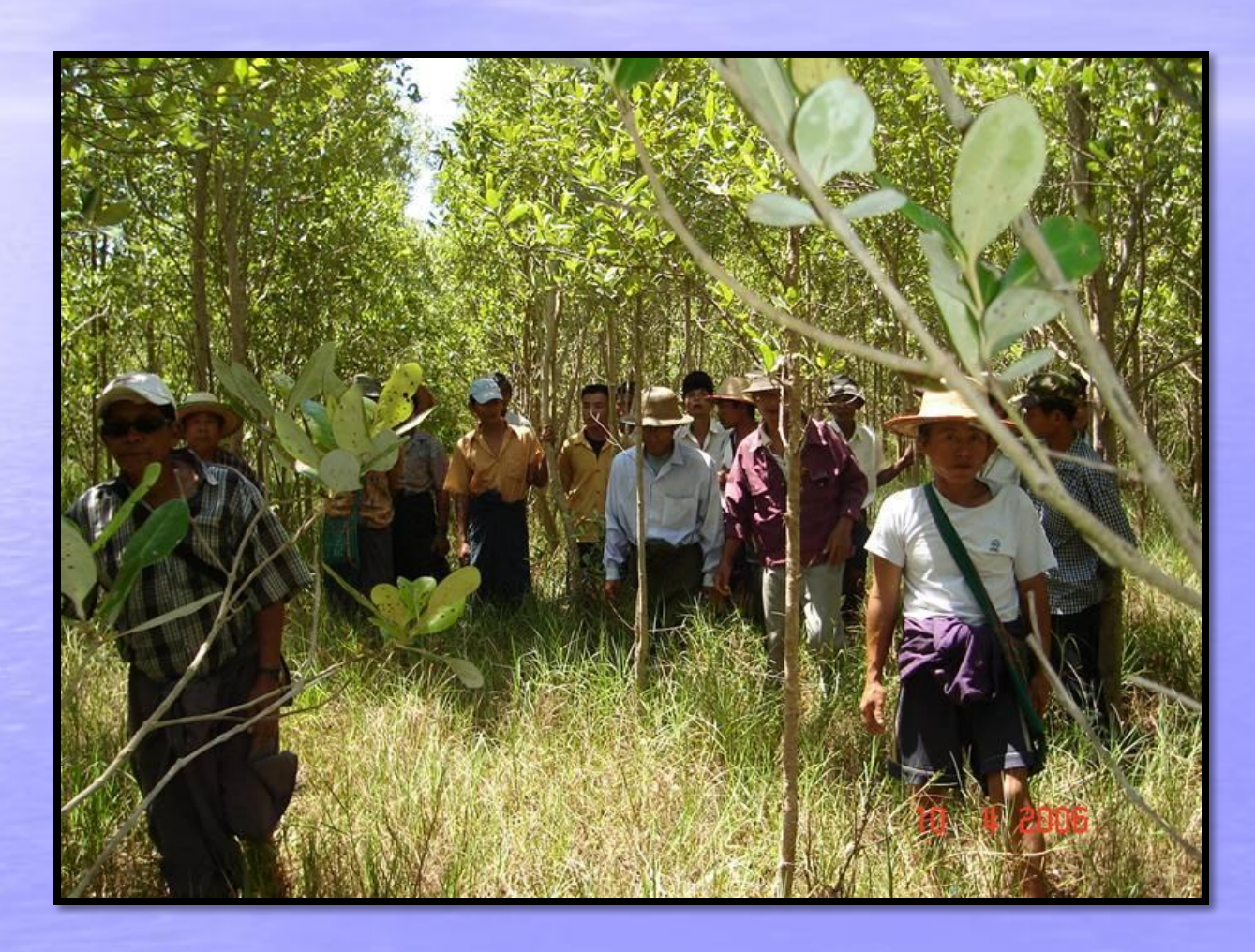
Cross Visit in Telbinseik and Bawathit Village Tract, Ahmar sub-township