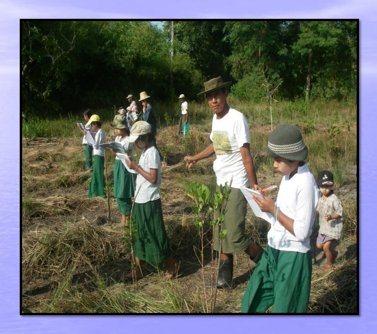
Kanyin kone village, Ahmar sub-township