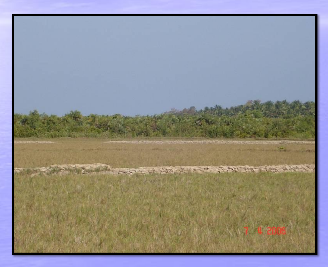
Pyindaye Reserved Forest