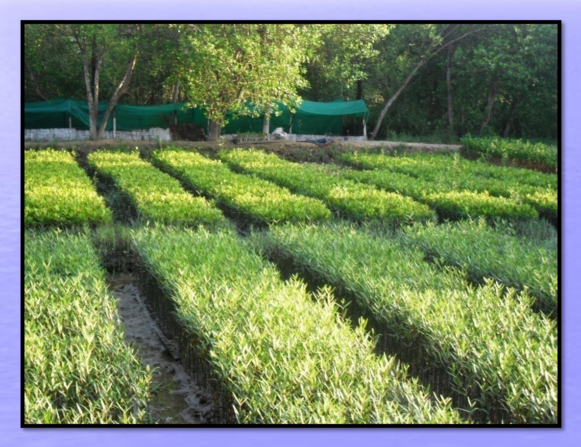
FREDA/ACTMANG Oakpho Kwin Chaung Mangrove Nursery