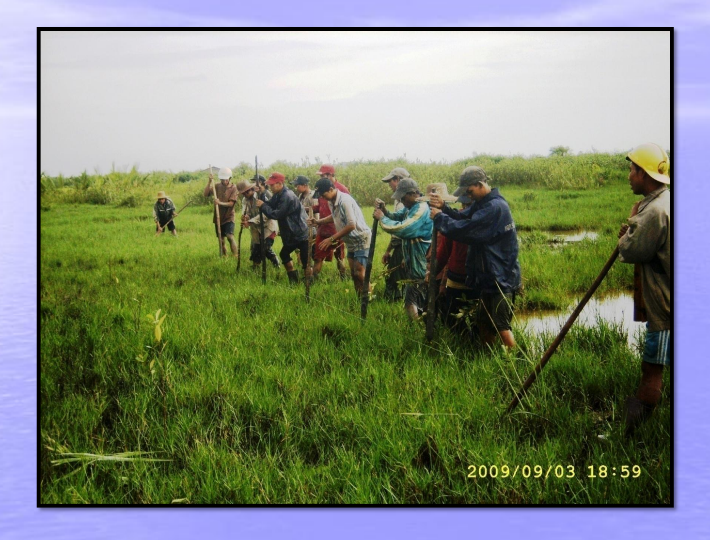
Oakpho kwin chung village, Ahmar sub-township