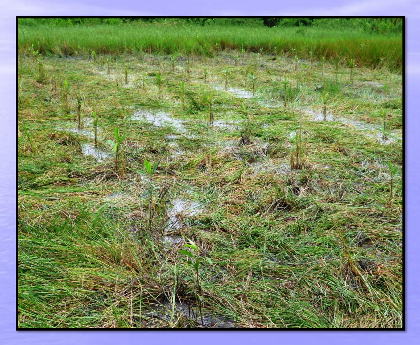
Kyat phyu chaung Village, Bogalay Township