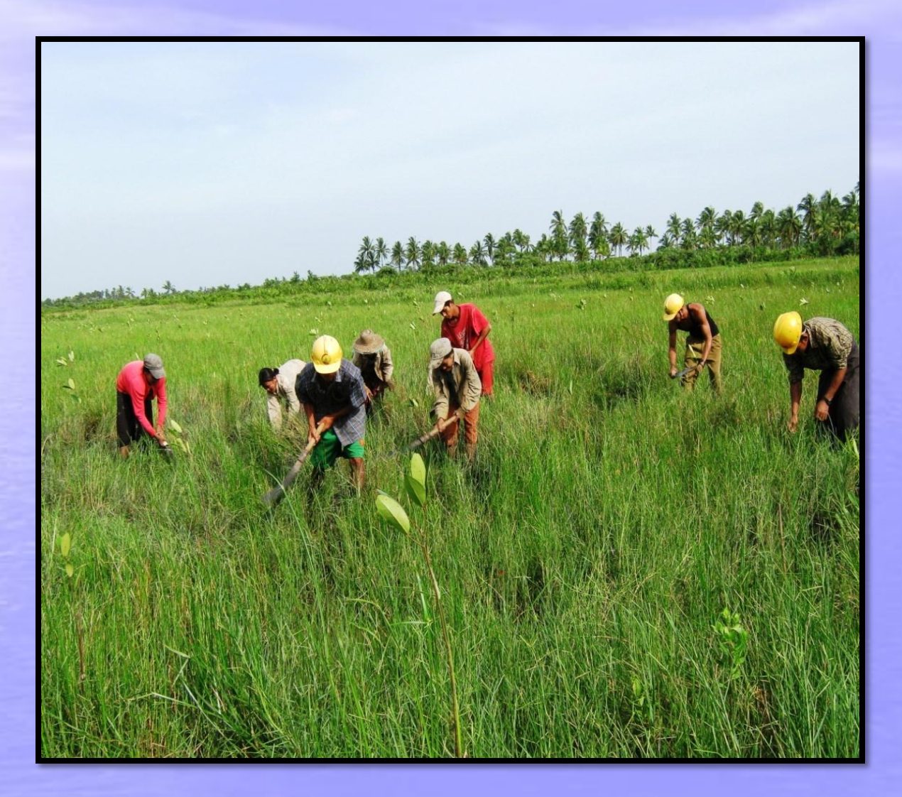
Oakpho kwin chaung Village, Ahmar sub-township