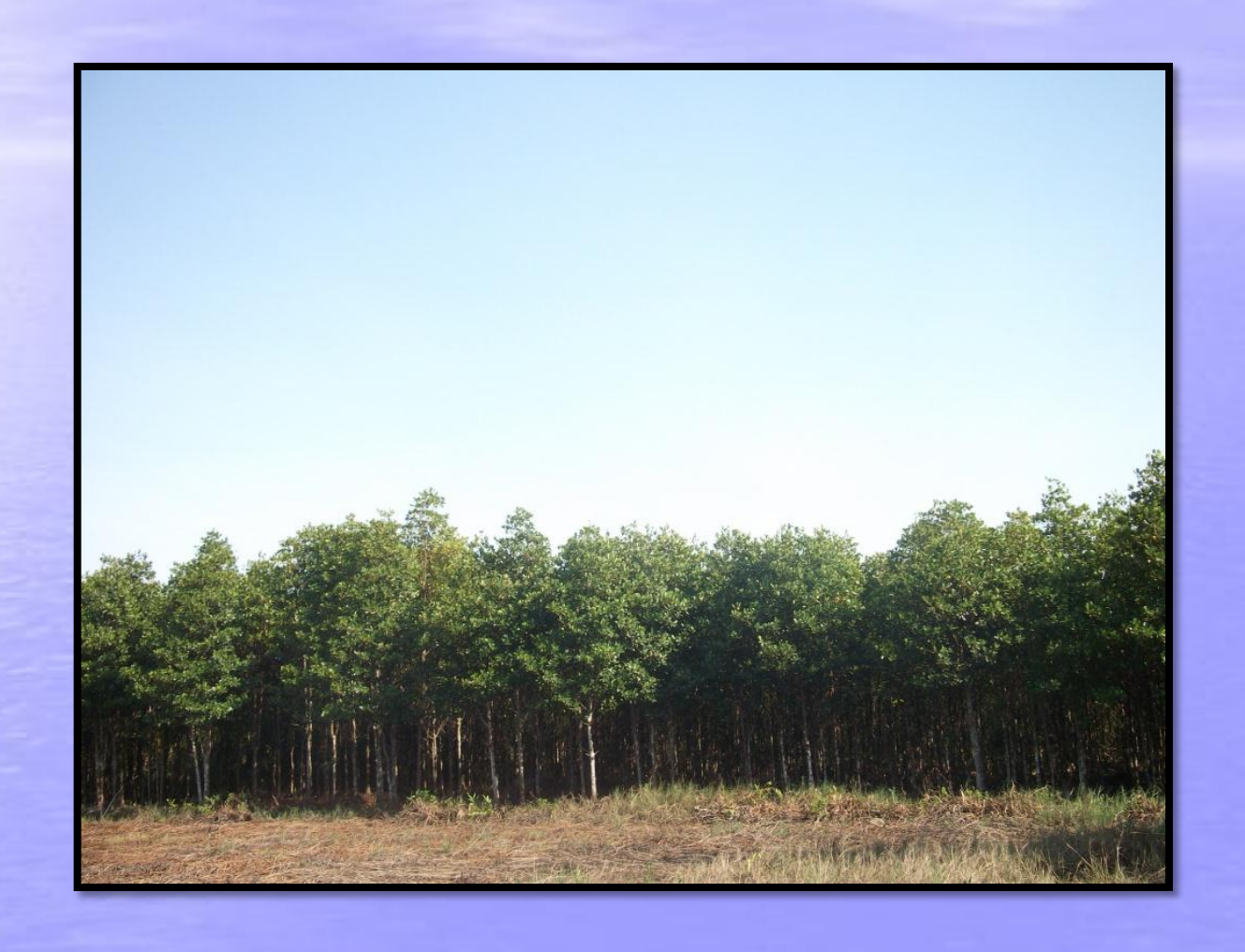
Bruguiera sexangula (2002) Plantation in Telbinseik village