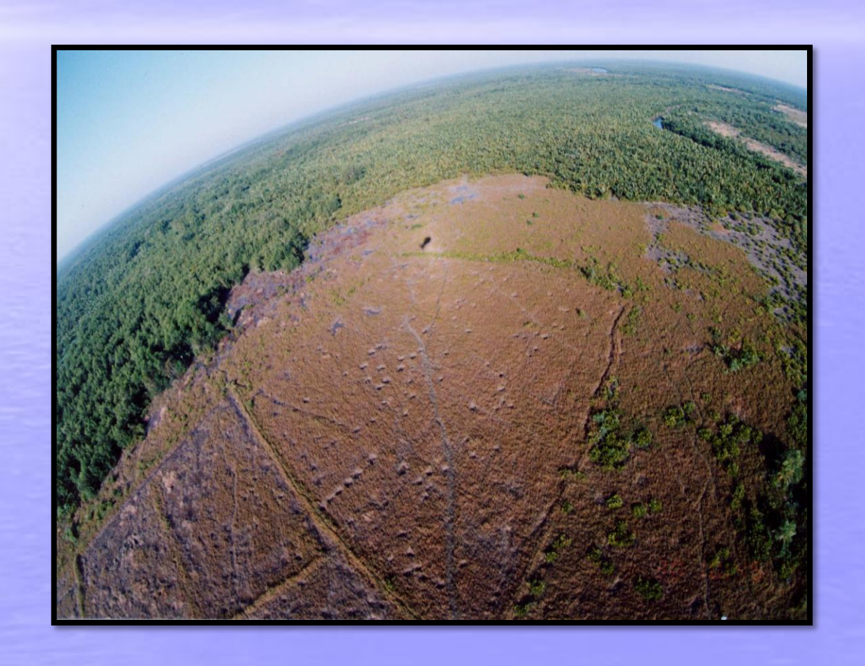
Telbinseik village Tract, Ahmar Sub-township