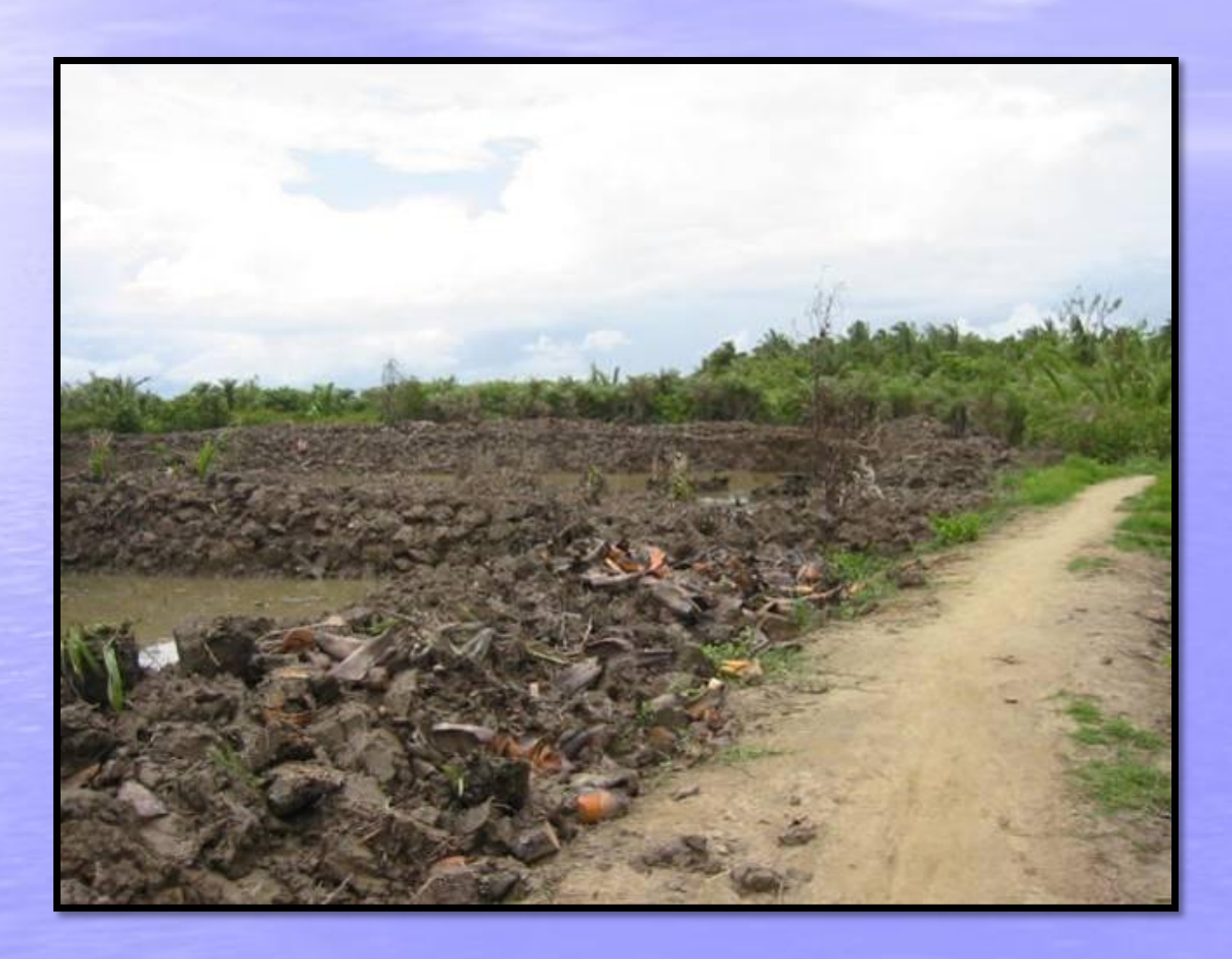
Mangrove Reserved Forest