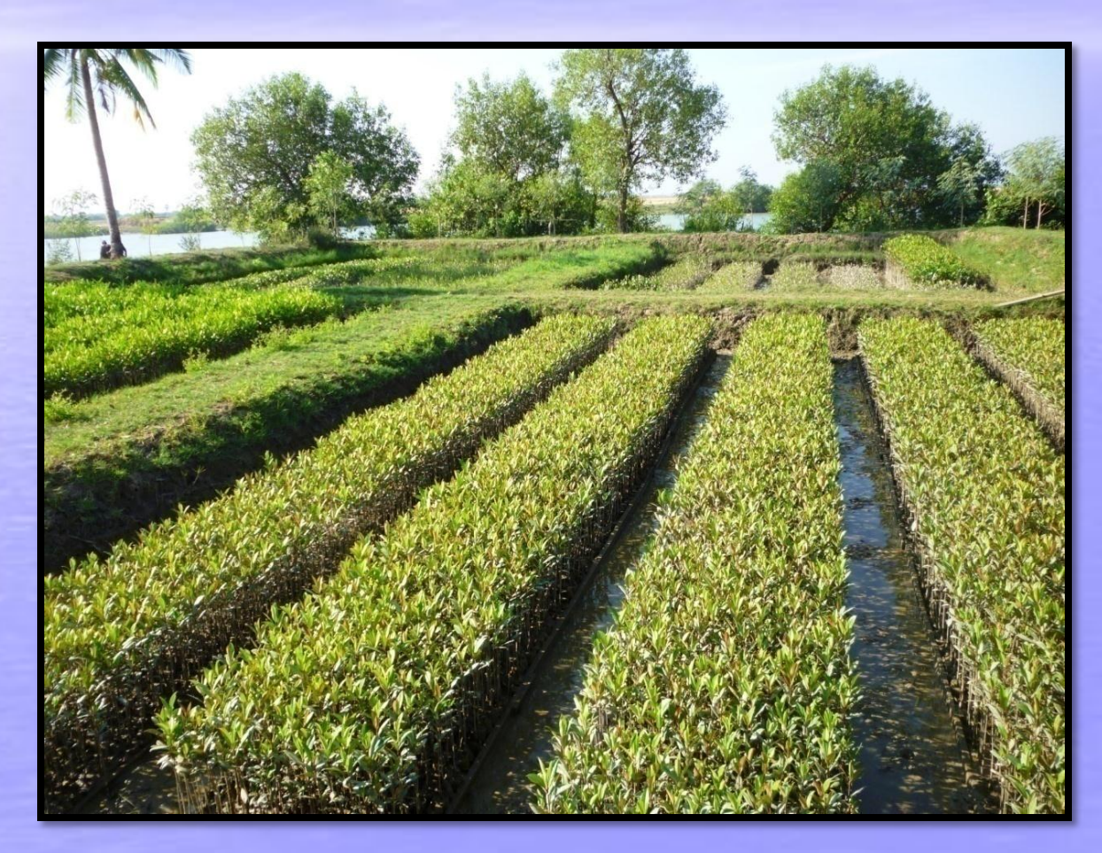
FREDA/EED Htaw Paing Mangrove Nursery