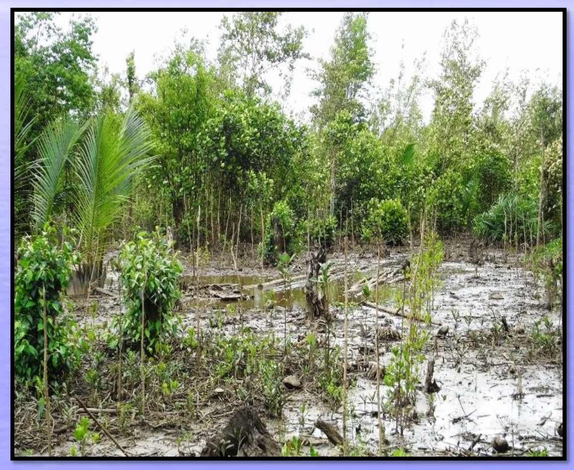
Wapana village, Ahmar Sub-township