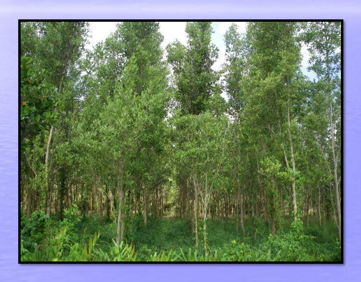
Warkone village, Ahmar Sub-township