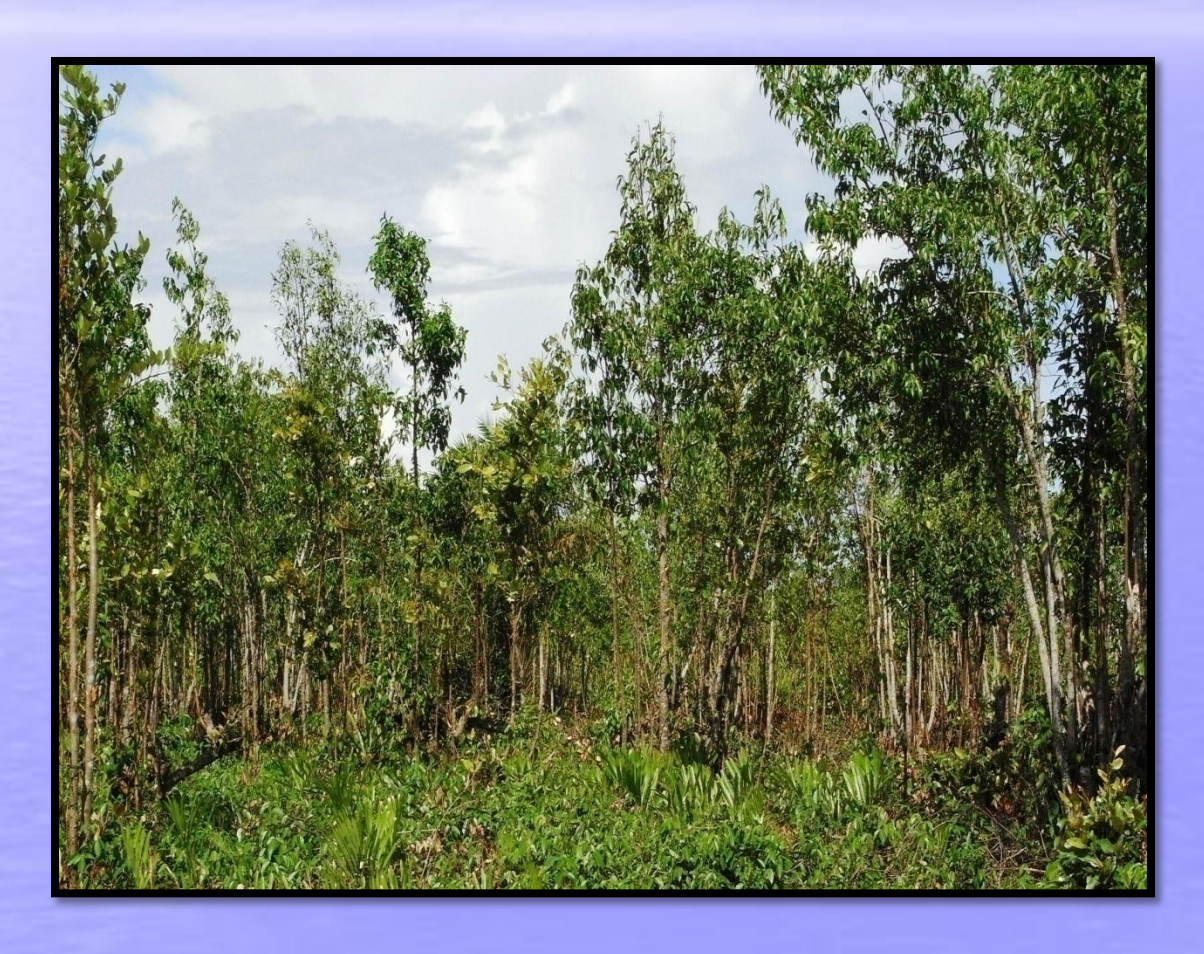
2 Bawathit village, Ahmar Sub-township