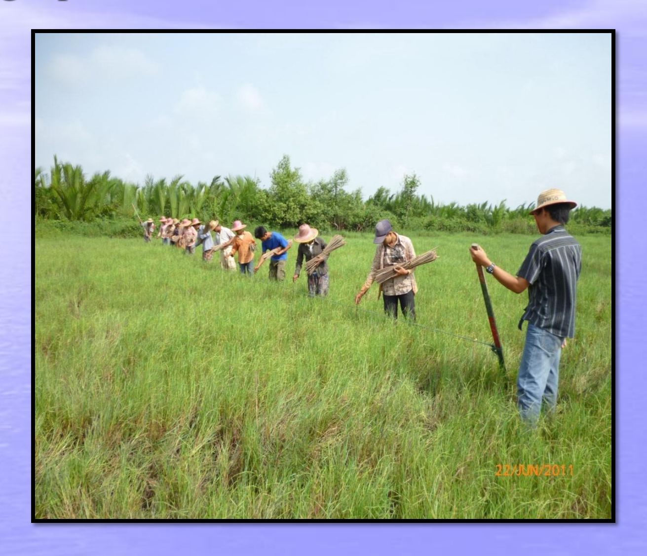
Kyauk Taing Village, Ahmar sub-township