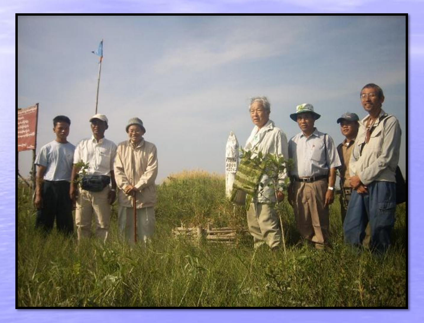
Kadonekani Reserved Forest