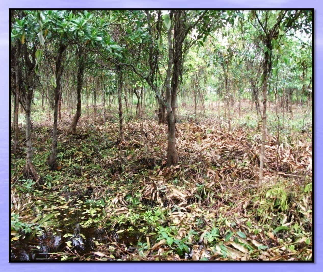
Bruguiera sexangula (2002)