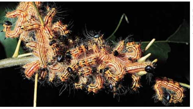
Yellowneck caterpillars defoliating one branch at a time