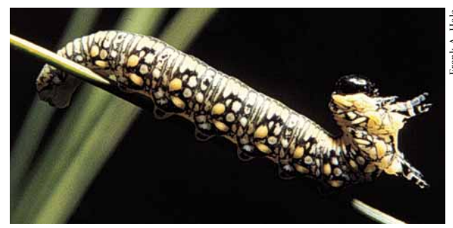
Introduced pine sawfly on white pine