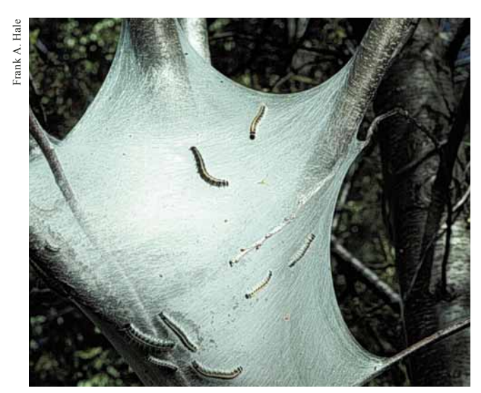
Eastern tent caterpillar nest on black cherry

Hale, F. A. 2001. PB1589. Commercial insect and mite control for trees, shrubs and flowers. Agricultural Extension Service, The University of Tennessee.