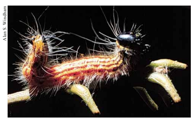
Feeding damage from yellowneck caterpillar