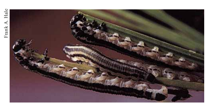
Eight pair of prolegs on the pine sawfly larvae