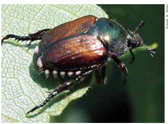
Adult Japanese beetle