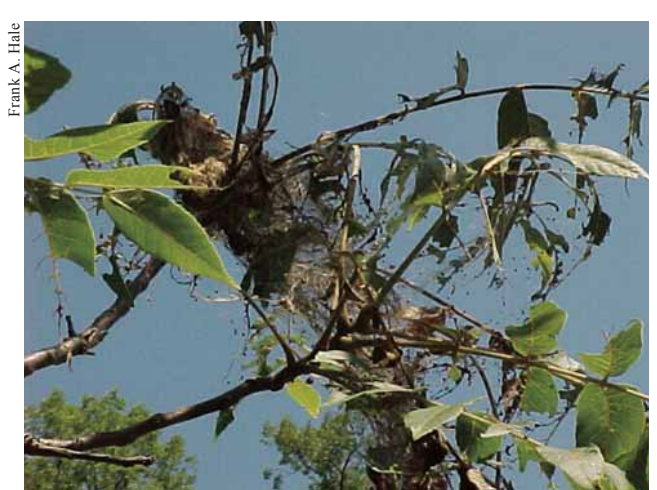
Fall webworm webbing on black walnut