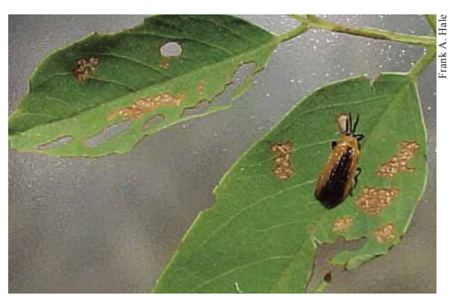
Locust leafminer adult with feeding damage