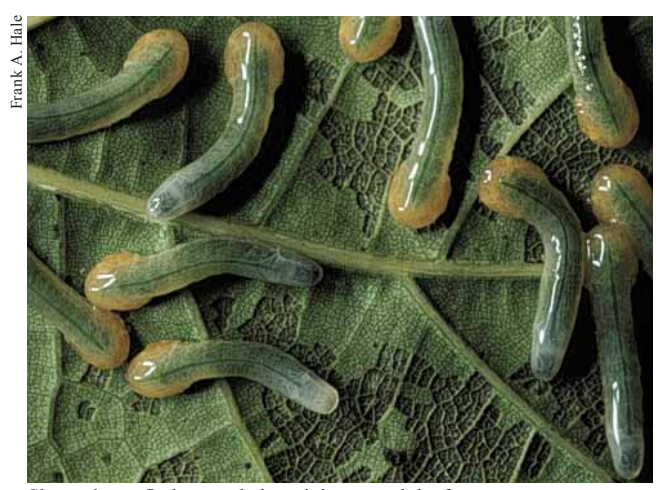
Slug oak sawfly larvae skeletonizing an oak leaf