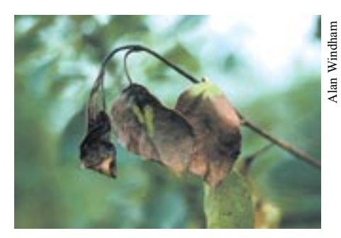
Fire blight on crabapple leaves.