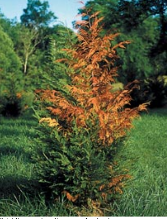
Seiridium canker disease on Leyland cypress.