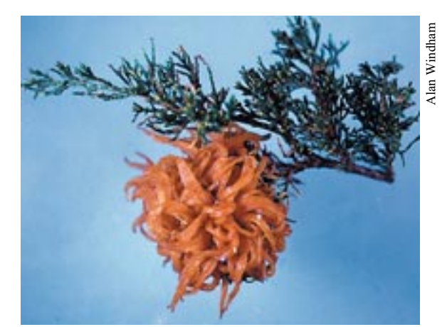
Tendrils of cedar apple rust gall.