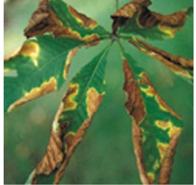
Leaf blotch fungal disease on buckeye.

• Dogwood anthracnose and sycamore anthracnose may occur annually and weaken or kill infected trees. Dogwood anthracnose is much more damaging to flowering dogwood growing as an understory tree in full shade.