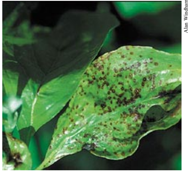
Spot anthracnose on dogwood leaves.

• Anthracnose diseases of maple and ash occur sporadically and are seldom a serious threat. Ash anthracnose may cause 50 percent defoliation within a few days of infection.