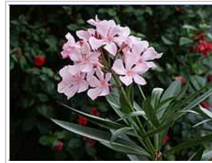
Oleander is toxic to humans and animals.

circumstances. Scientists at the University of Eastern Piedmont in Italy claimed to have identified this as the plant responsible for producing the sardonic grin , [64][65] and it is the most-likely candidate for the "sardonic herb," which was a neurotoxic plant used for the ritual killing of elderly people in Phoenician Sardinia . When these people were unable to support themselves, they were intoxicated with this herb and then dropped from a high rock or beaten to death. Criminals were also executed in this way. [66]