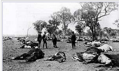
700 cattle that were killed overnight by poisonous plants. Australia, 1907.