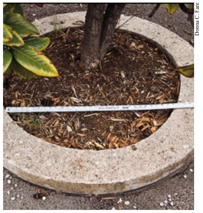
An in-ground tree planter with a magnolia tree.

An important aspect of container or well planting is the soil or growing medium. A fast draining, porous medium is important to provide air space; but the medium must have enough water-holding capability to provide the water needs of the plant. Heavy, poorly-drained soils such as clay can be a primary cause for plant failures. In wells, aeration can be enhanced by using horizontal and vertical pipes. A good growth medium contains peat moss, organic materials, sand and sandy loam soil. Peat moss provides good water-holding capability in the medium. If too much peat moss is used, the medium may not drain as well and the air space could be restricted. Good substitutes for peat moss are rice hulls, cotton gin waste and kenaf. Most garden centers stock a good selection of prepared potting media.