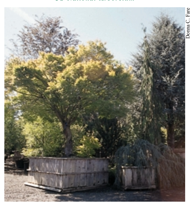
Pleasing example of a group of trees growing in containers.

Landscaping in a small area is challenging, but popular. Planting trees in small areas can limit root and shoot development. Proper selection of plant material for small areas is important to ensure a healthy environment for the plant. Sidewalks, patios, decks, entrances, courtyards and other small areas can be landscaped with the use of containers or wells with restricted soil area.