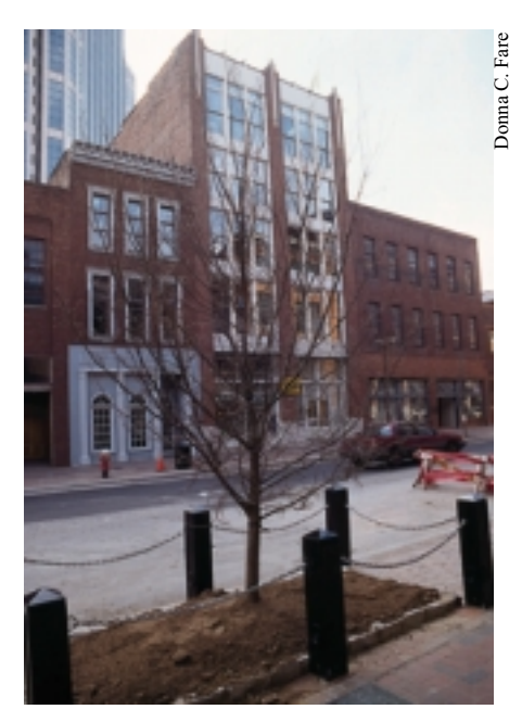
An island for tree planting along a sidewalk