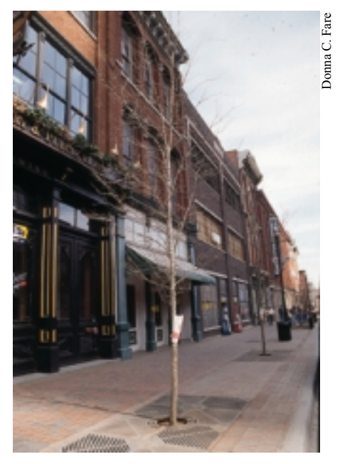
Tree planted in a well and covered with a grate on a city sidewalk.